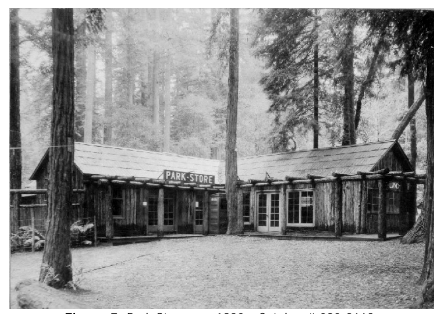
Figure 5. Park Store, ca. 1930s. Catalog # 090-3663.

The CCC was discontinued with American entry into World War II in 1941, but development and expansion of the park resumed soon after the war. New employee residences were built at Lower Sky Meadow in 1949, and the 1950s saw the removal or remodel of several dated features, such as filled-in swimming pools and updated water and sewage treatment systems. New features like the Sempervirens Reservoir were also introduced. In 1961, the State of California purchased 488 acres of adjacent land from the Big Creek Timber Company, which included Golden Falls, Silver Falls, and Lower Berry Creek Falls. In 1982, the State acquired, named, and classified two subunits: 23-