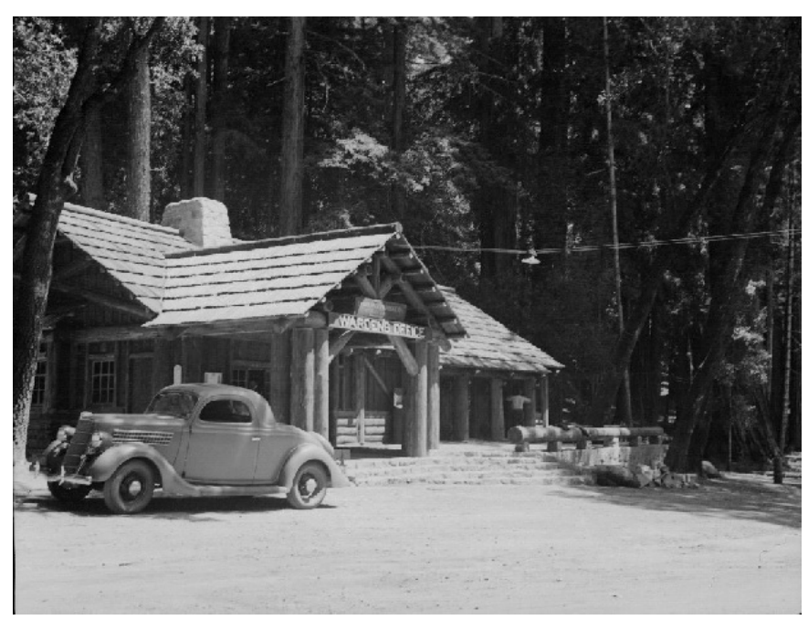
Figure 4. Administration building, ca. 1930s. Catalog # 090-3668.