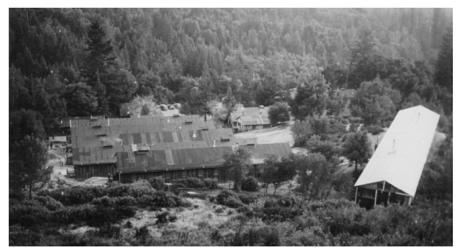
Figure 2. CCC work camps, ca. 1939. Catalog # 090-3586.

and cut-log benches in 1935, the Nature Museum and Store in 1938, and expanded the Nature Lodge in 1939, in addition to building roads, a trail network, campsites, ranger residences, garages, work sheds, and other facilities ( Figure 3-5 ). CCC-era buildings, designed in the Park Rustic architectural style and constructed out of local natural materials, still stand in the park's original 3,800-acre acquisition. Together with the ancient stand of coast redwoods and the area's other natural resources, the Park Headquarters constitute a historic district nominated to the National Register of Historic Places.