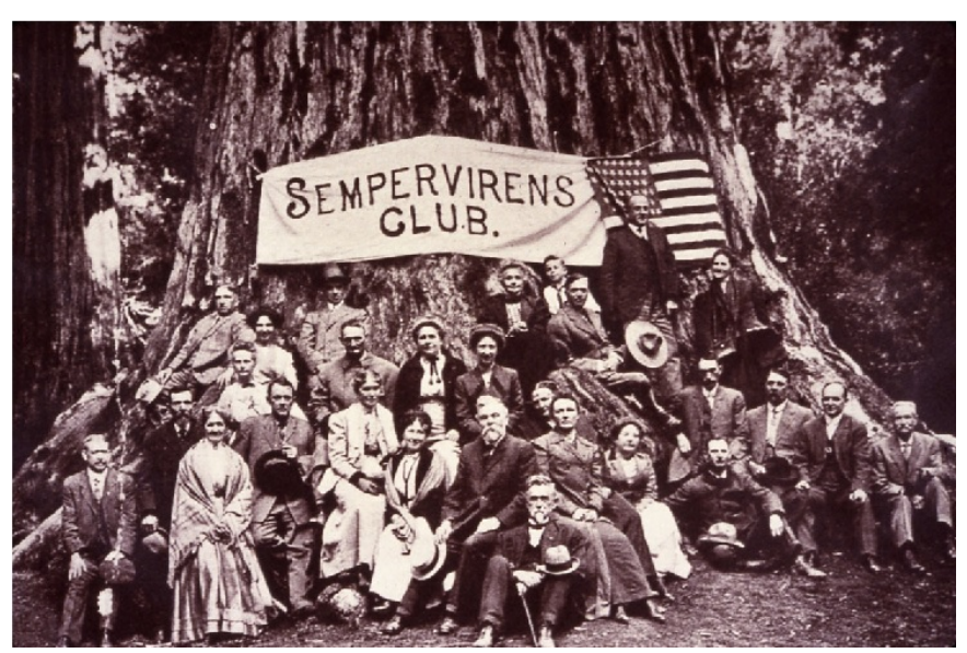
Figure 1. Sempervirens Club, ca. 1900. Catalog # 090-S9146.