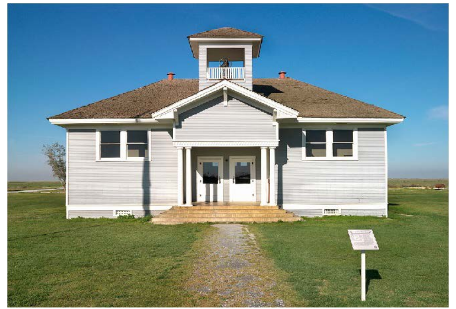
Figure 6. Restored Allensworth Elementary School, March 18, 2008. Catalog # 090-P57336.