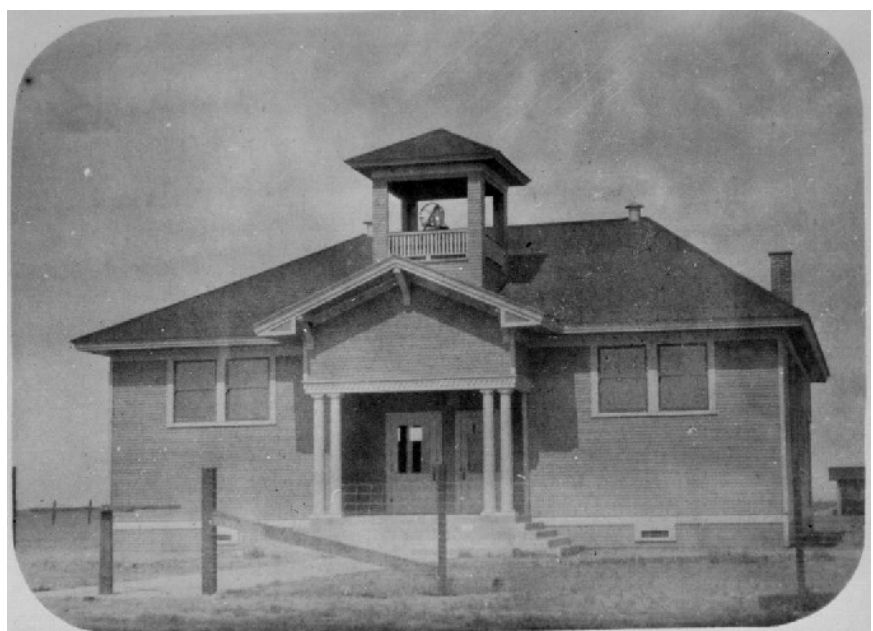
Figure 3. Allensworth Elementary School, ca. 1915. Catalog # 090-2123.

Schoolhouse building was constructed, and a branch of the Tulare County Free Library was dedicated the following year (Figures 3 and 4) . Besides profiting as a railway depot, the town's economy was driven by agriculture, with commercial farmers producing grain, alfalfa, and dairy on the surrounding acreage. Although residents' lives were a constant struggle with the arid, highly alkaline landscape, the town thrived for a brief period.