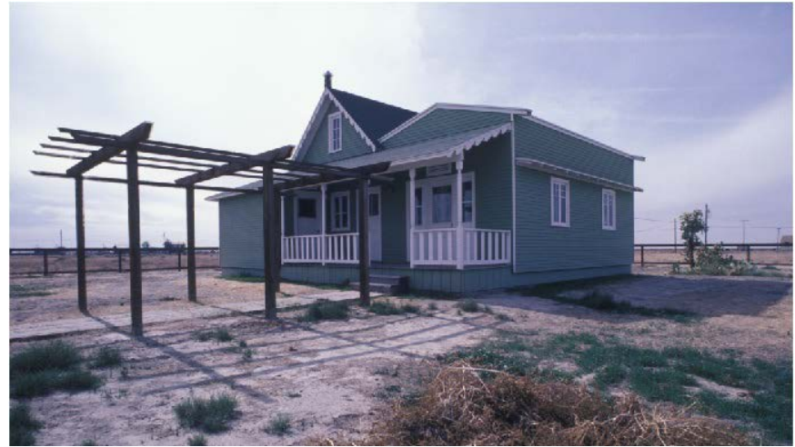
Figure 5. Restored home of Col. Allensworth, 1982. Catalog # 090-S8766.

California State Parks, coordinating with the Friends of Allensworth, preserves and interprets vital historical resources at Colonel Allensworth State Historic Park. Since acquiring the property, California State Parks employees and volunteers have restored, preserved, and reconstructed numerous historic buildings, including the Colonel Allensworth Home, the Allensworth Elementary School, the Tulare County Free Library, the First Baptist Church, the Hindsman General Store, and the Santa Fe Railroad Depot, with even more restoration projects planned for the future (Figures 5, 6, and 7) . The park also includes 115 acres of land set aside for agricultural interpretation and 50 acres reserved for support services. The park hosts numerous regular events, including the Colonel Allensworth Birthday Celebration, the Old Time Jubilee, Juneteenth, and the Annual Rededication Event. The park is open Thursdays through Sundays and for special events, and it provides 15 campsites, which accommodate both RVs and tents.