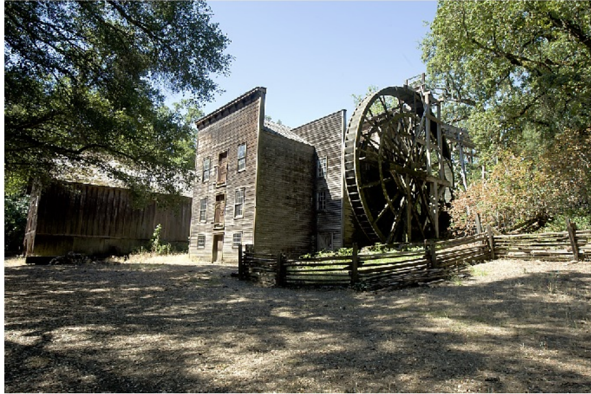
Figure 2. Bale's grist mill, August 1, 2011. Catalog # 090-P73773.