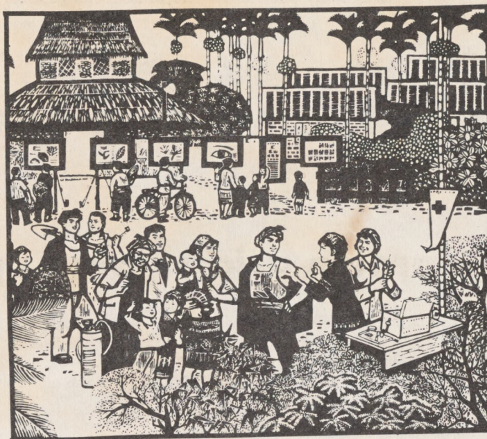
This Chinese woodcut depicts a medical team visiting a commune in rural China.

The United Farmworkers Union (AFL-CIO) is intensifying its boycott of grapes and lettuce throughout the U.S. During December the Guardian continued its coverage of this important struggle including an interview with Cesar Chavez.