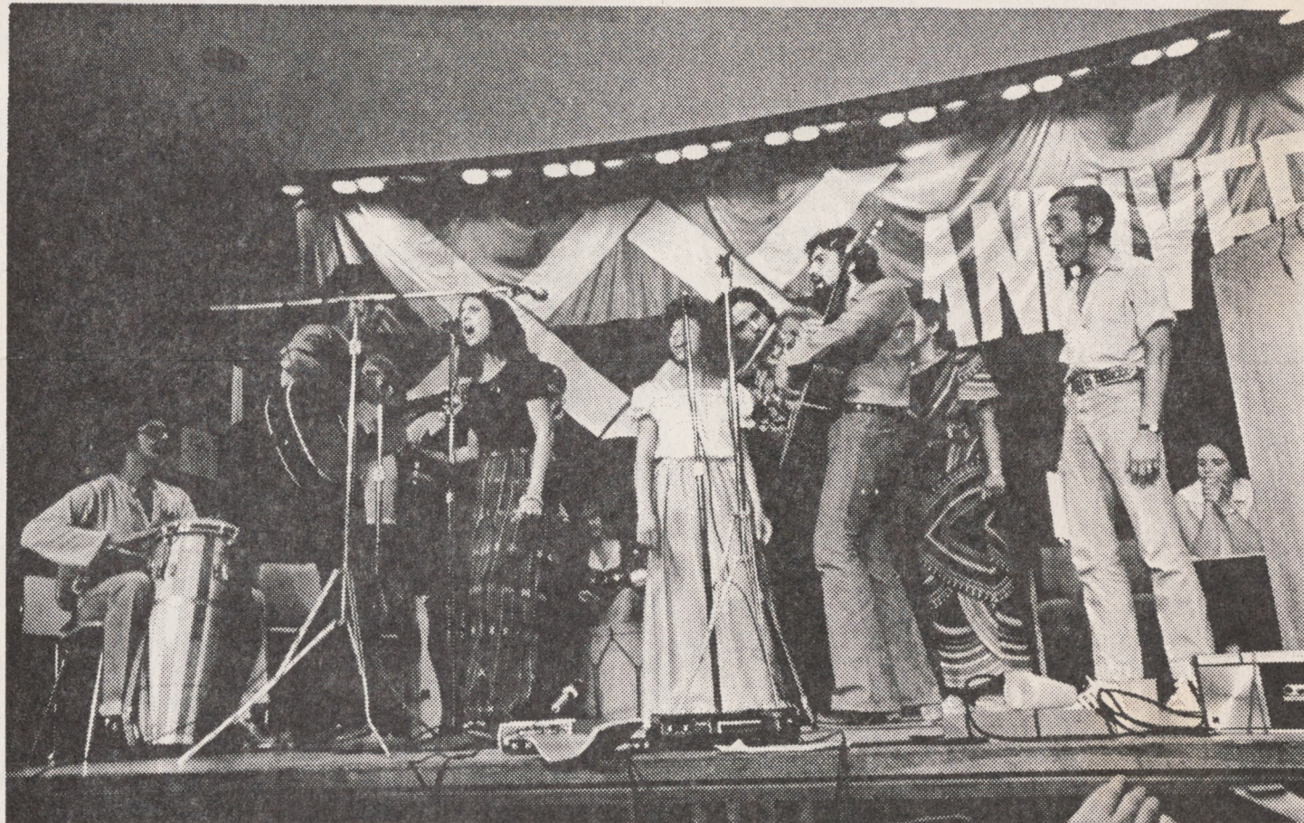
"El Grupo" Puerto Rican singing ensemble in a recent appearance at ExpoCuba in New York. They will appear at Guardian 25th Anniversary Celebration at Hunter College, November 24th.