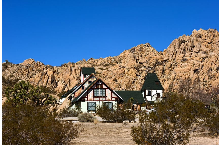
Figure 2. Antelope Valley Indian Museum, February 13, 2012. Catalog # 090-P75833.