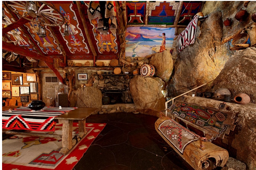
Figure 3. Antelope Valley Indian Museum (interior), February 13, 2012. Catalog # 090-P75858.