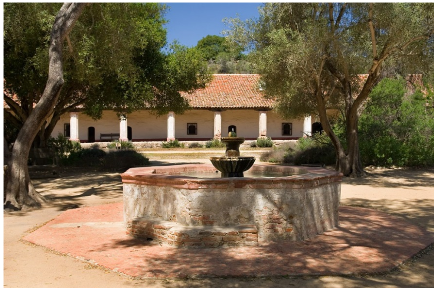
Figure 12. La Purísima Mission courtyard with central fountain, April 12, 2007. Catalog # 090-P54281.