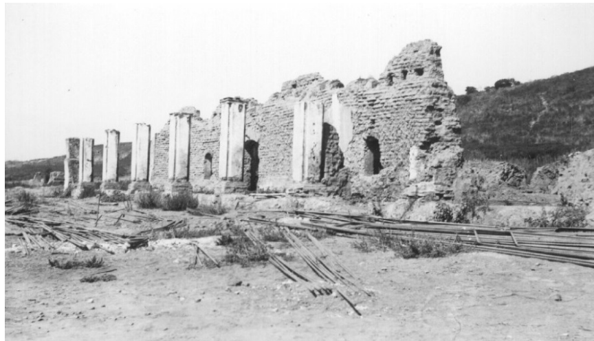
Figure 4. Padre's Residence ruins, September 1935. Catalog # 090-27078.