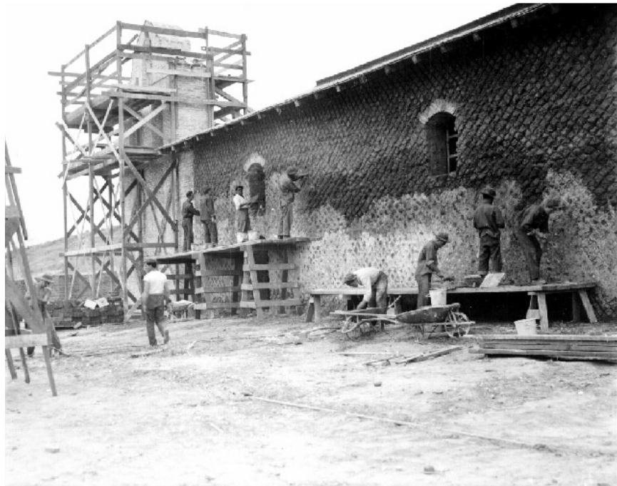
Figure 7. CCC enrollees plastering walls, ca. 1930s. Catalog # 090-4385.