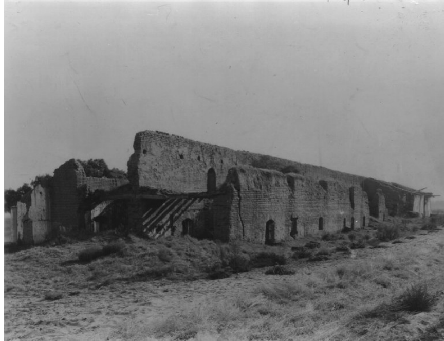
Figure 3. Padre's Residence ruins, ca. 1908. Catalog # 090-27064.