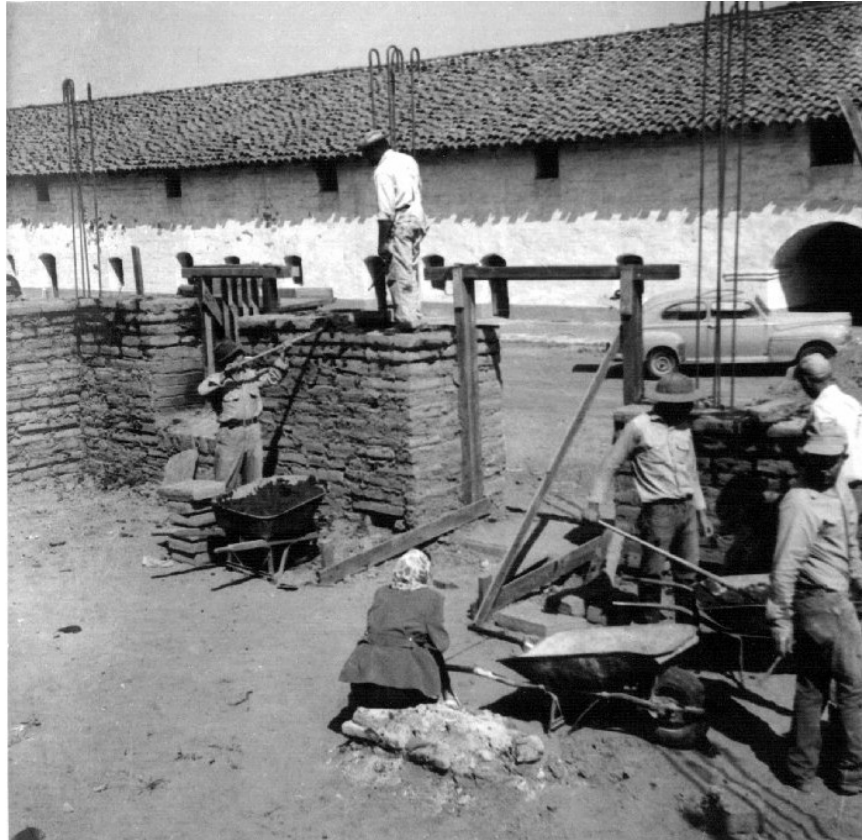
Figure 10. Reconstruction of mill building, 1958. Catalog # 090-4260.

California State Parks, coordinating with Prelado de los Tesoros de la Purisima ("Keepers of the Treasures of La Purisima")—a volunteer organization formed in 1973—maintains various natural, cultural, and historical resources at La Purisima Mission State Historic Park ( Figures 11-13 ). In addition to the reconstructed Spanish mission (the most extensively restored mission in the state) the park also contains 25 miles of hiking and horseback-riding trails, picnic areas, a visitors' center and exhibit hall, and livestock. Open for guided and self-guided tours, the park also hosts several annual events, including Candlelight Tours in October and various Founding Day celebrations on December 8. The park is day-use only and is open seven days a week except on holidays.