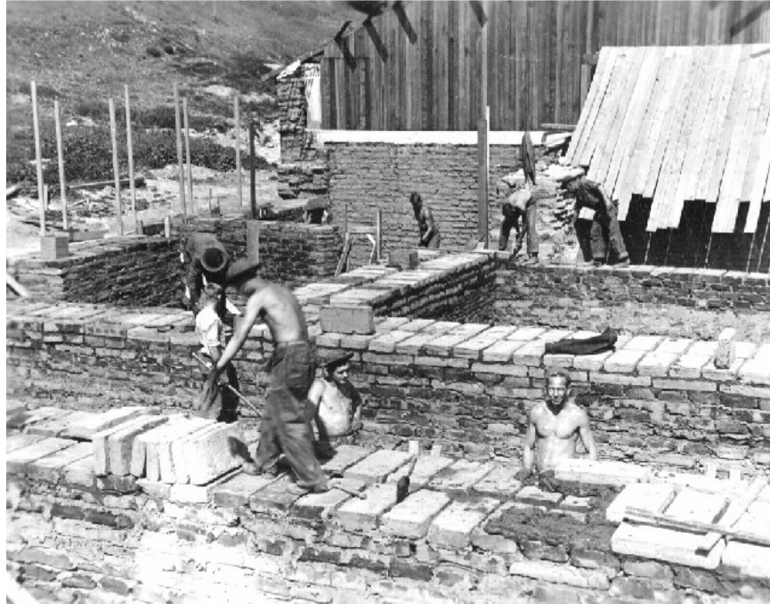
Figure 6. CCC enrollees building adobe walls, ca. 1930s. Catalog # 090-4383.