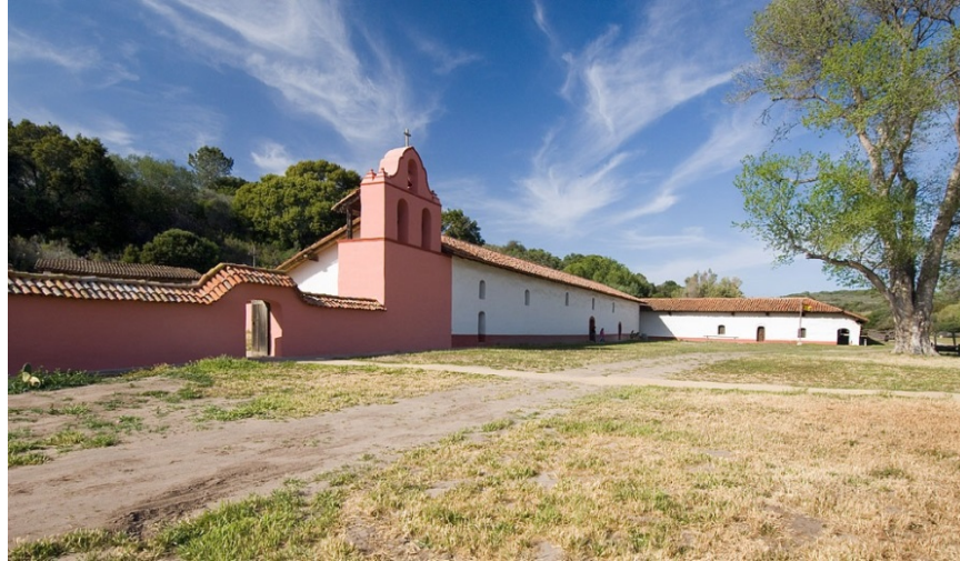
Figure 11. La Purísima Mission (exterior), April 8, 2007. Catalog # 090-P53362.