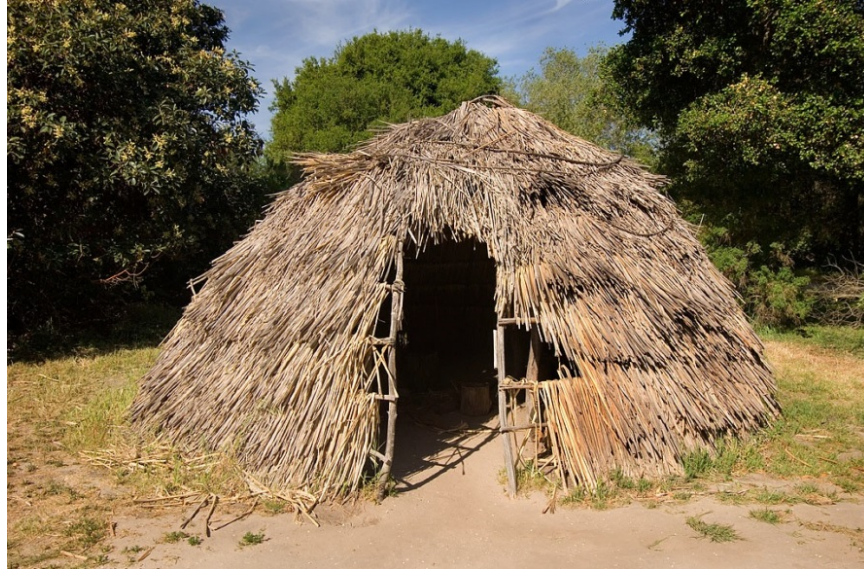
Figure 13. Reconstructed Chumash tule hut, April 8, 2007. Catalog # 090-P54377.