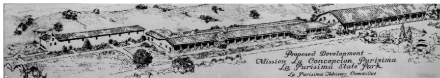
Figure 5. La Purísima Advisory Committee Proposed Development, ca. 1934. Catalog # 090-4231.