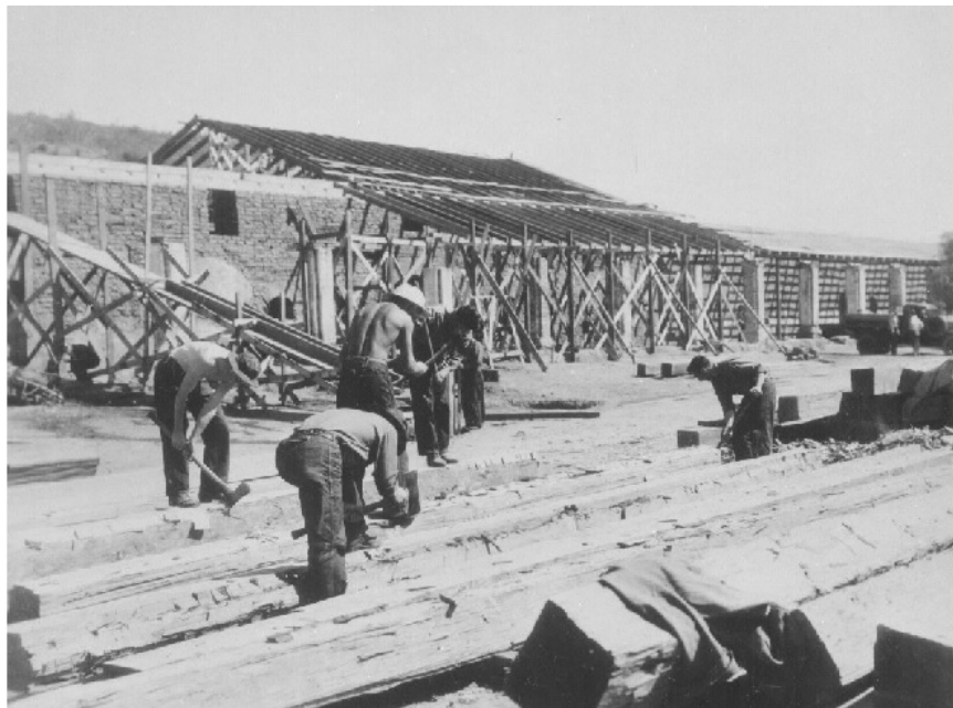
Figure 9. CCC enrollees hewing timber, January 1938. Catalog # 090-4560.