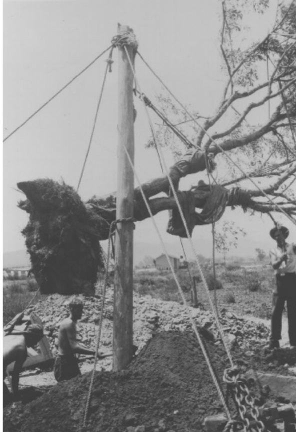
Figure 8. CCC enrollees transplanting olive tree, ca. 1937. Catalog # 090-29702.