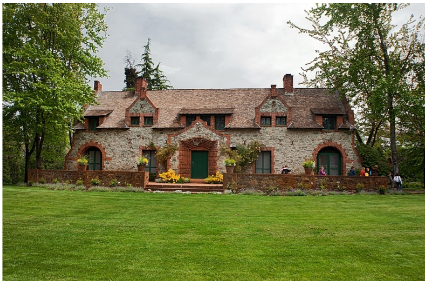
Figure 4. Bourn Cottage with visitors, May 3, 2012. Catalog # 090-P77271.