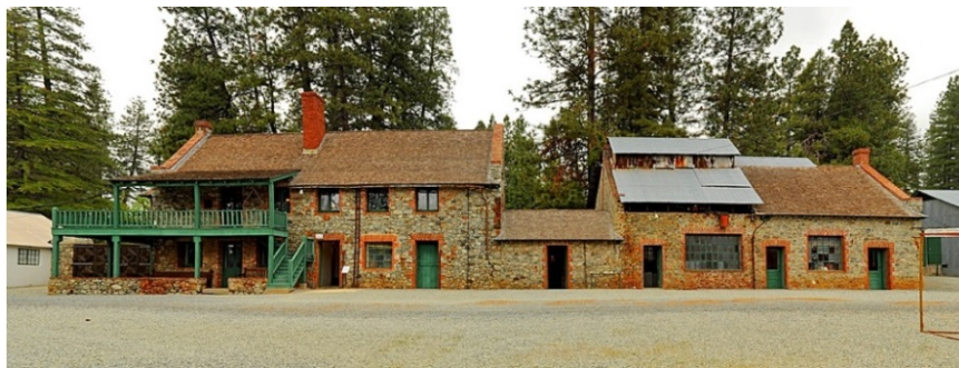
Figure 3. Empire Mine offices, May 3, 2012. Catalog # 090-P77298.

California State Parks, coordinating with the Empire Mine Park Association, has preserved, restored, and reconstructed numerous historical resources at Empire Mine State Historic Park. In addition to the restored mining operations facilities—including the offices of the mining engineer, manager, and assayer, the refinery room, warehouses, welding shop, machine shop, blacksmith shop, compressor building, hoist house, and cyanide plant—the park also contains the fully restored Empire Clubhouse, greenhouse with formal gardens, and Empire Cottage, an English Renaissance-style mansion designed by San Francisco architect Willis Polk in 1897 ( Figures 3 and 4 ). Also included are a Visitor Center and museum, picnic areas, and miles of hiking and horseback trails. The park is open seven days a week, offers guided tours, and provides RV-accessible overnight facilities.