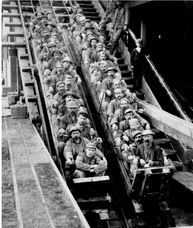
Figure 2. Cornish miners changing shifts, ca. 1898. Catalog # 090-16163.