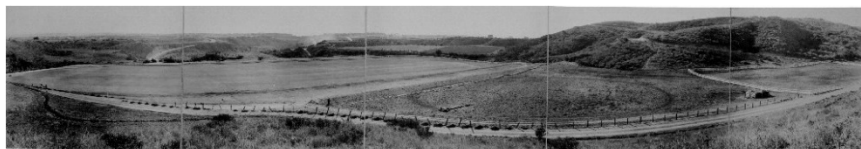
Figure 3. Panoramic view of ranch and polo field, 1926. Catalog # 090-2847.

A lifelong equestrian, Rogers had always desired a large ranch to accommodate his growing stable of horses. With its vast acreage, relative seclusion, and convenient proximity to Hollywood, the area that became Will Rogers Ranch suited Rogers's purposes perfectly. Soon after acquiring the land, Rogers graded roads and constructed a fully operational ranch ( Figures 3 and 4 ). Additionally, he built a Ranch-style "getaway" cabin for himself and his wife, Betty, and three children, Will Jr., Mary, and Jim ( Figures 5 and 6 ). By 1930, the Rogers family had moved to the property from their home in Beverly Hills, and by 1935, the cabin had been expanded to include 31 rooms, 11 baths, and 7 fireplaces. The grounds included 13 outbuildings, rolling lawns, pastures, riding arenas, and a large polo field ( Figures 7 and 8 ).