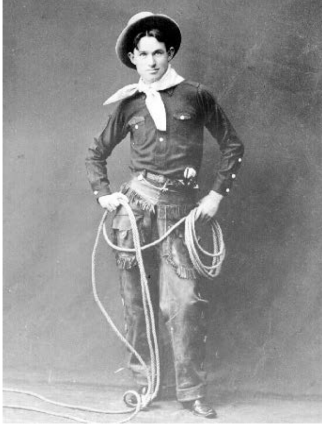
Figure 1. Will Rogers, "The Cherokee Kid," after 1900. Catalog # 090-2931.