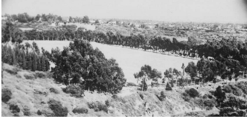
Figure 7. Aerial view of polo field, after 1928. Catalog # 090-2820.