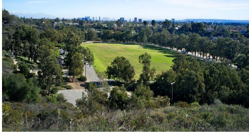
Figure 13. Polo field (with downtown Los Angeles), January 26, 2013. Catalog # 090-P79519.