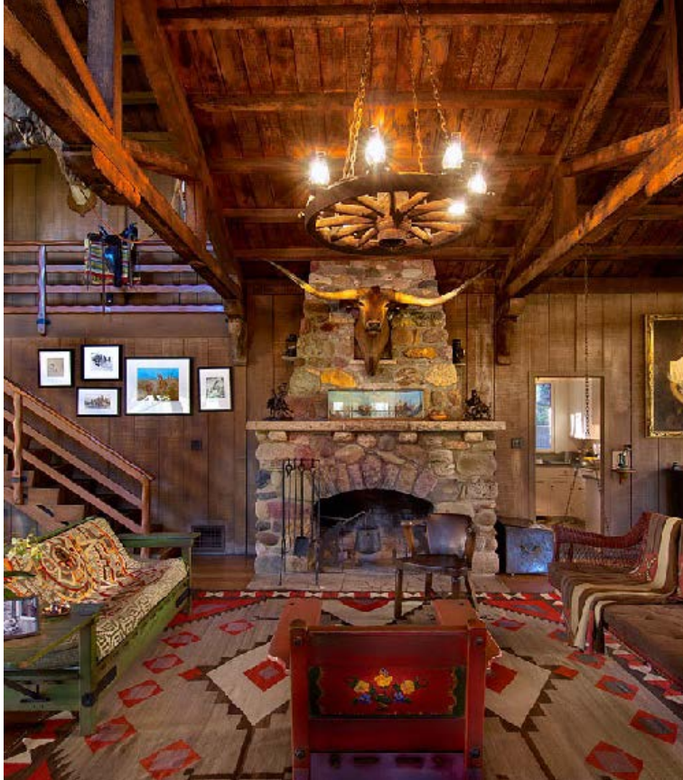
Figure 11. Will Rogers Ranch House (interior), January 26, 2014. Catalog # 090-P79563.