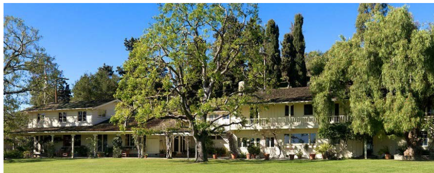
Figure 10. Will Rogers Ranch House, January 26, 2013. Catalog # 090-P79479.