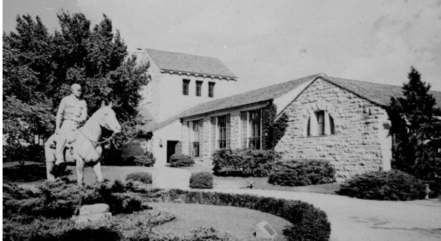
Figure 9. Will Rogers memorial and ranch house, 1938. Catalog # 090-3116.