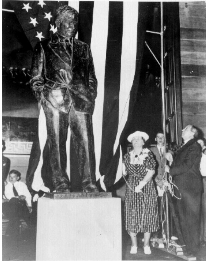
Figure 2. Will Rogers Memorial in Claremore, Oklahoma, 1938. Catalog # 090-2913.