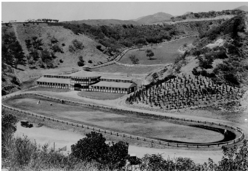
Figure 8. Stables and racetrack, 1928. Catalog # 090-2844.