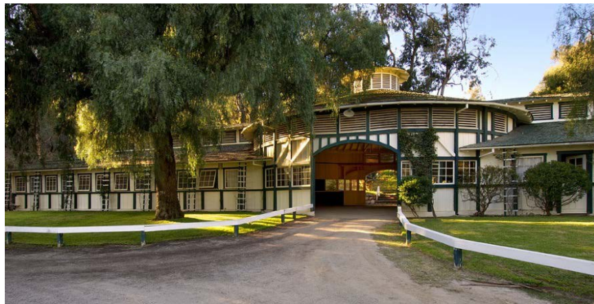
Figure 12. Stables, January 26, 2013. Catalog # 090-P79493.