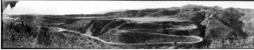
Figure 4. Panoramic view of ranch with road gradations, 1926. Catalog # 090-2850.