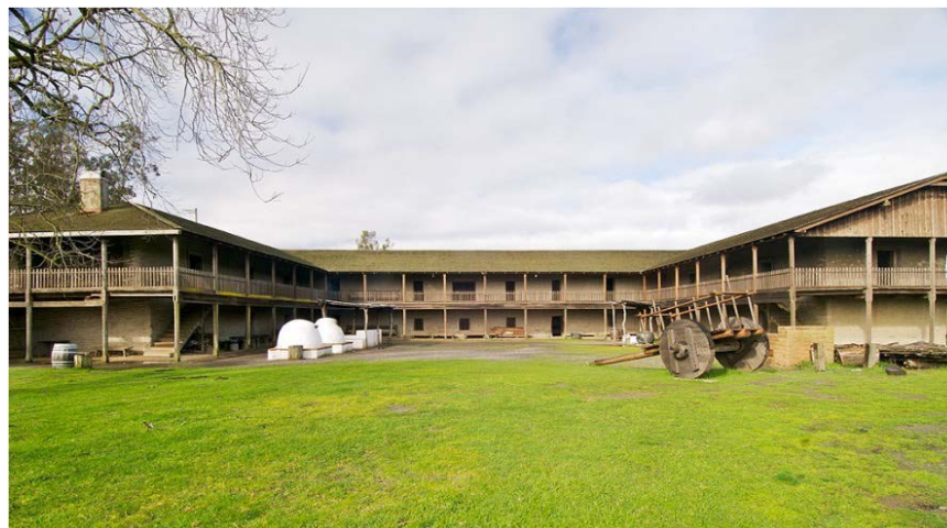
Figure 4. Rancho Petaluma courtyard, January 23, 2008. Catalog # 090-P56591.

California State Parks, coordinating with the Sonoma/Petaluma State Historic Parks Association, preserves and interprets historical and cultural resources at Petaluma Adobe State Historic Park ( Figures 4 and 5 ). In addition to providing guided and self-guided tours of the restored adobe building, the park unit also includes a visitor center with a museum and day-use picnic areas. Closed on Mondays and holidays, the park hosts various living history events throughout the year.