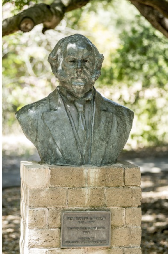
Figure 5. Bust statue of General Mariano Guadalupe Vallejo, July 22, 2015. Catalog # 090-P89914.