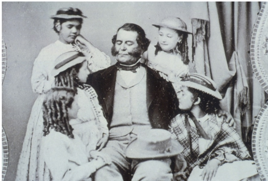
Figure 1. General Mariano Guadalupe Vallejo with his daughters, ca. 1860. Catalog # 090-S17601.

Following Mexico's successful separation from Spain in 1821, the Mexican government undertook a comprehensive program to secularize all church properties contained in the mission system over the next two decades. Dividing and selling church holdings as land grants, in 1834 Governor José Figueroa ordered Lieutenant Mariano Guadalupe Vallejo to secularize Mission San Francisco Solano and establish a pueblo at Sonoma ( Figure 1 ). Promoted to Commandant General, Vallejo ultimately received in two installments a 66,000-acre land grant, which he named Rancho de Petaluma.