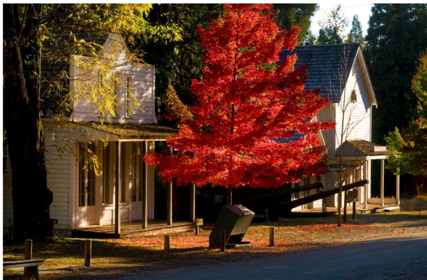
Figure 3. North Bloomfield, October 22, 2009. Catalog # 090-P66490.

California State Parks, coordinating with the Malakoff Diggins Park Association, preserves and interprets numerous historical, natural, and cultural resources at Malakoff Diggins State Historic Park ( Figures 3 and 4 ). In addition to hydraulic-mining sites and restored and reconstructed buildings in the historic town of North Bloomfield, the park also features vast natural expanses and includes numerous camping and swimming facilities, over 20 miles of hiking trails, a visitor center and museum (open on weekends), and fishing areas for licensed anglers. The park is open for self-guided tours seven days a week from sunrise to sunset, and for reserved guided tours on weekends.