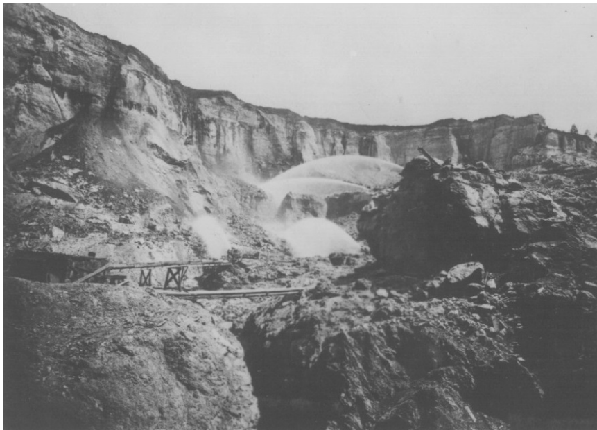
Figure 2. Hydraulic mining, ca. 1876. Catalog # 090-10234.