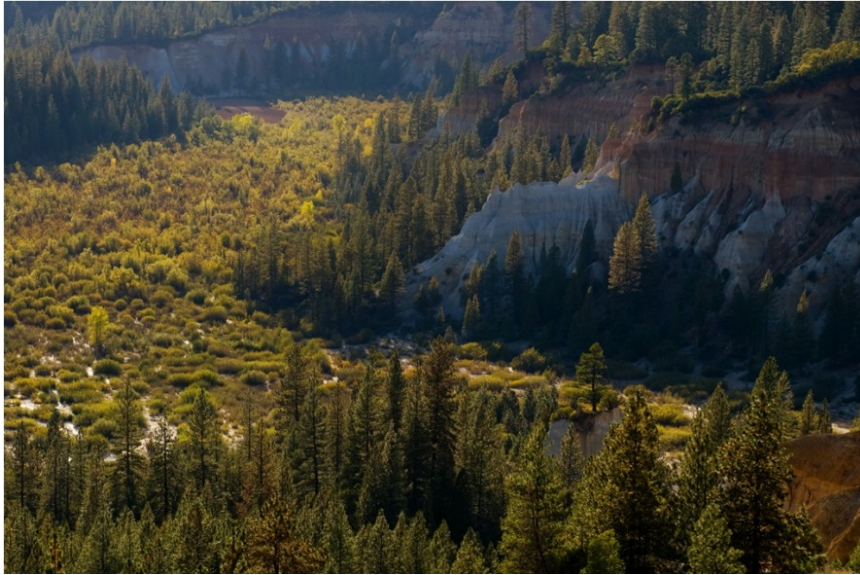
Figure 4. Malakoff Diggins valley mining area, October 22, 2009. Catalog # 090-P66495.