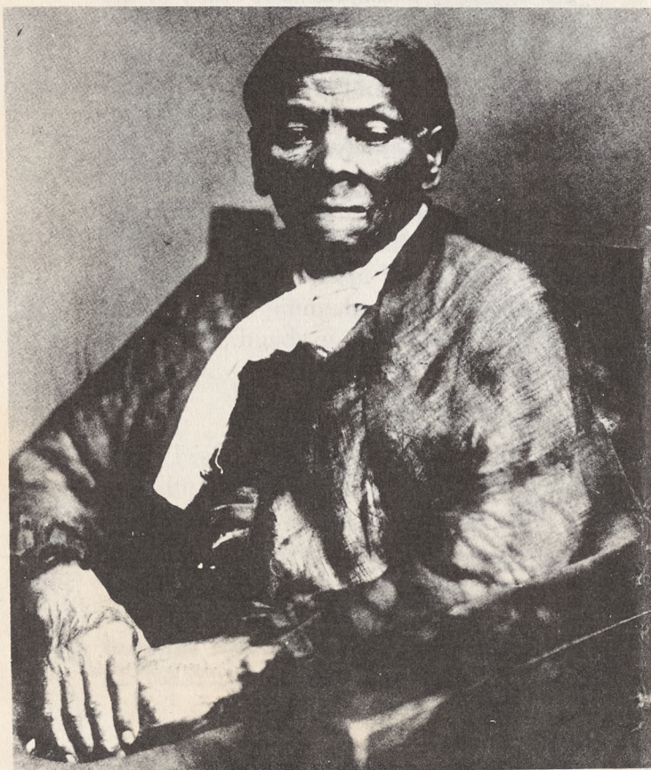
Harriet Tubman, best-known "conductor" of the Underground Railroad, guided slaves as far north as Canada to gain their freedom.

... women who had sucking children suffered much from their breasts becoming full of milk, the infants being left at home; they therefore could not keep up with the other hands: I have seen the overseer beat them with raw hide so that the blood and the milk flew mingled from their breasts. 9