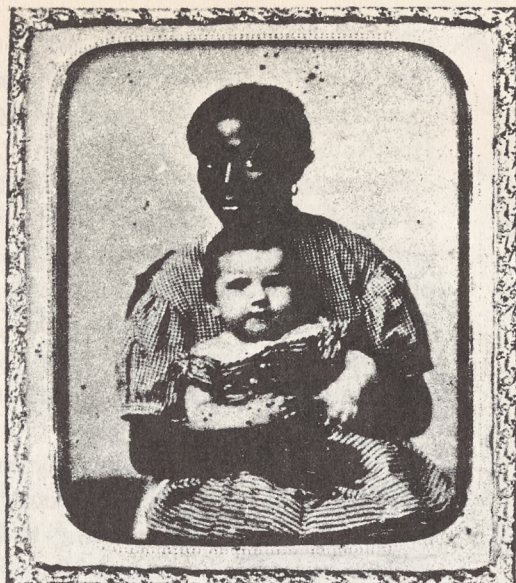
Slave and Friend