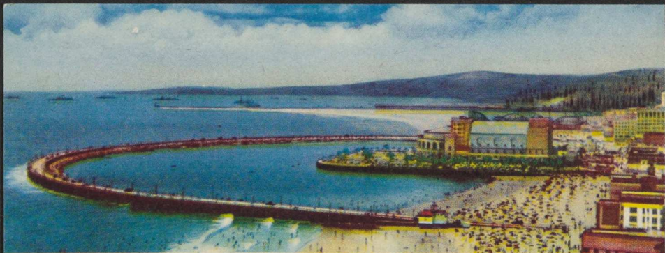
LONG BEACH, CALIFORNIA