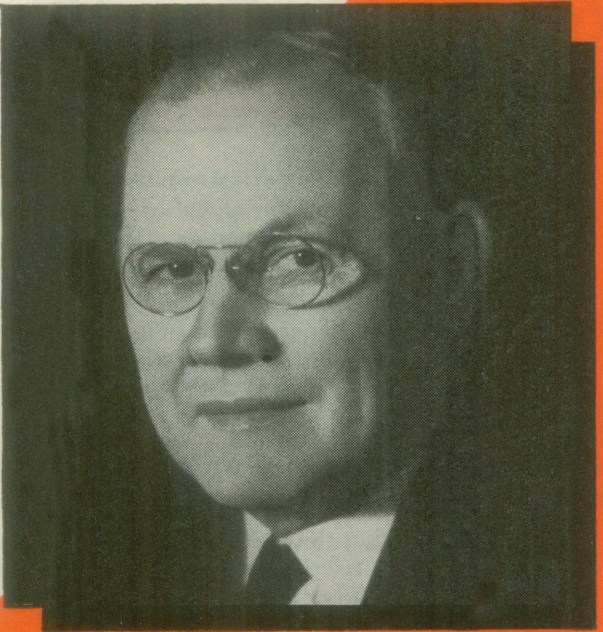
William Green, President The American Federation of Labor

"The faces of all working men and women must be turned everlastingly against racial and religious discrimination and in favor of freedom, liberty, equality and democracy.