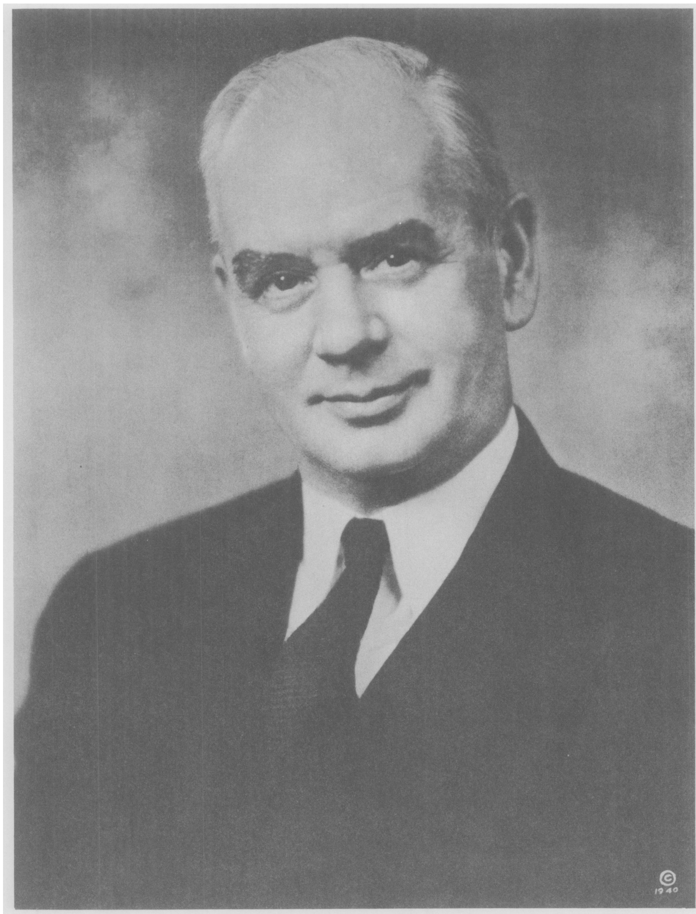
PHILIP MURRAY, PRESIDENT CONGRESS OF INDUSTRIAL ORGANIZATIONS