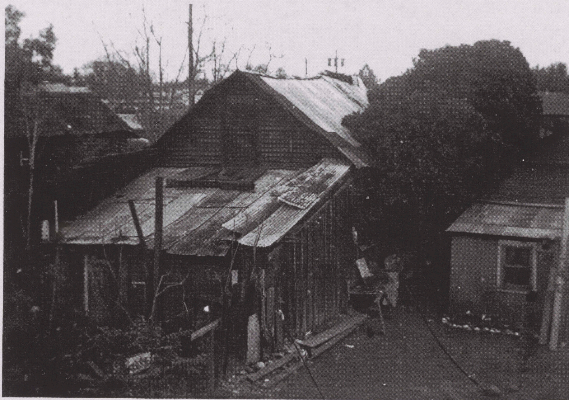
Backyard of Jee Wah Tong - Oroville