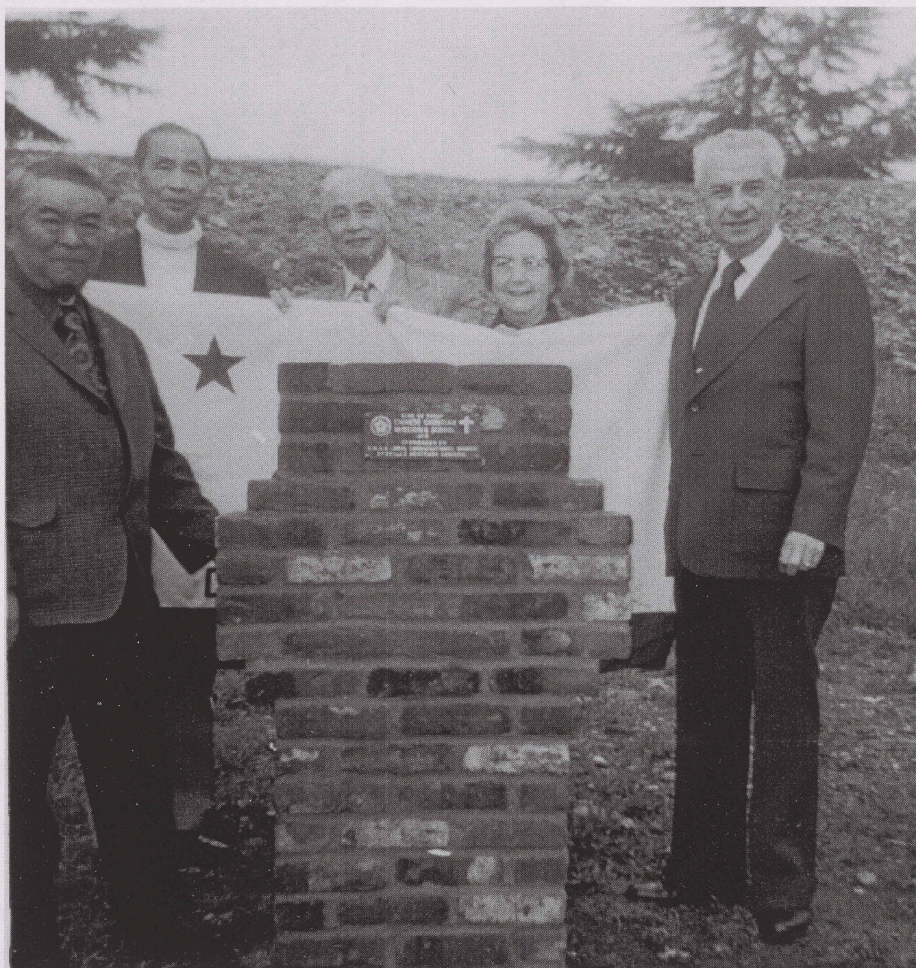
Chinese Christian Mission School Dedication Feb. 27, 1978