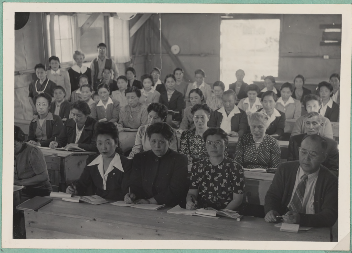
ENGLISH AND AMERICANIZATION CLASS