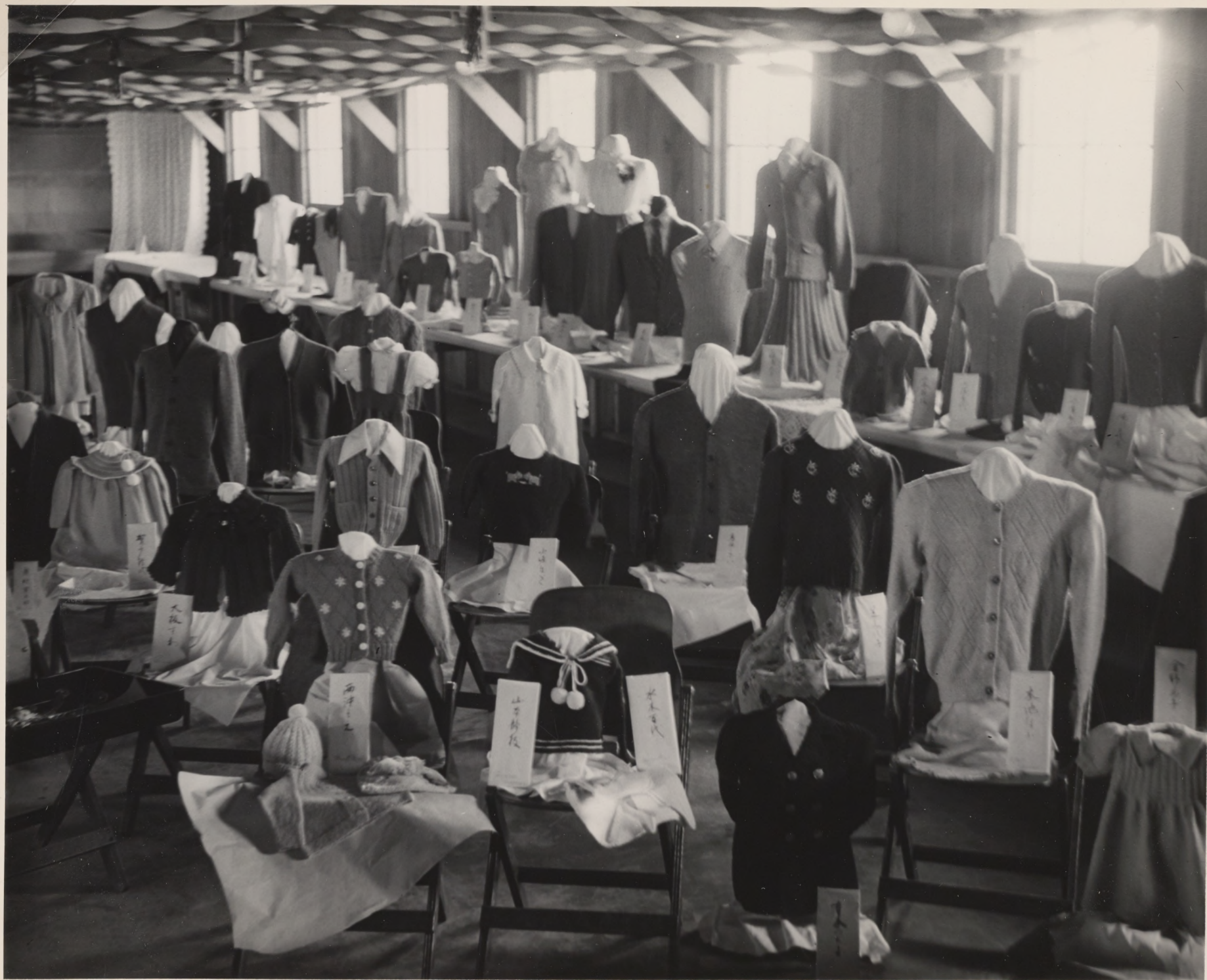
KNITTED GOODS EXHIBIT