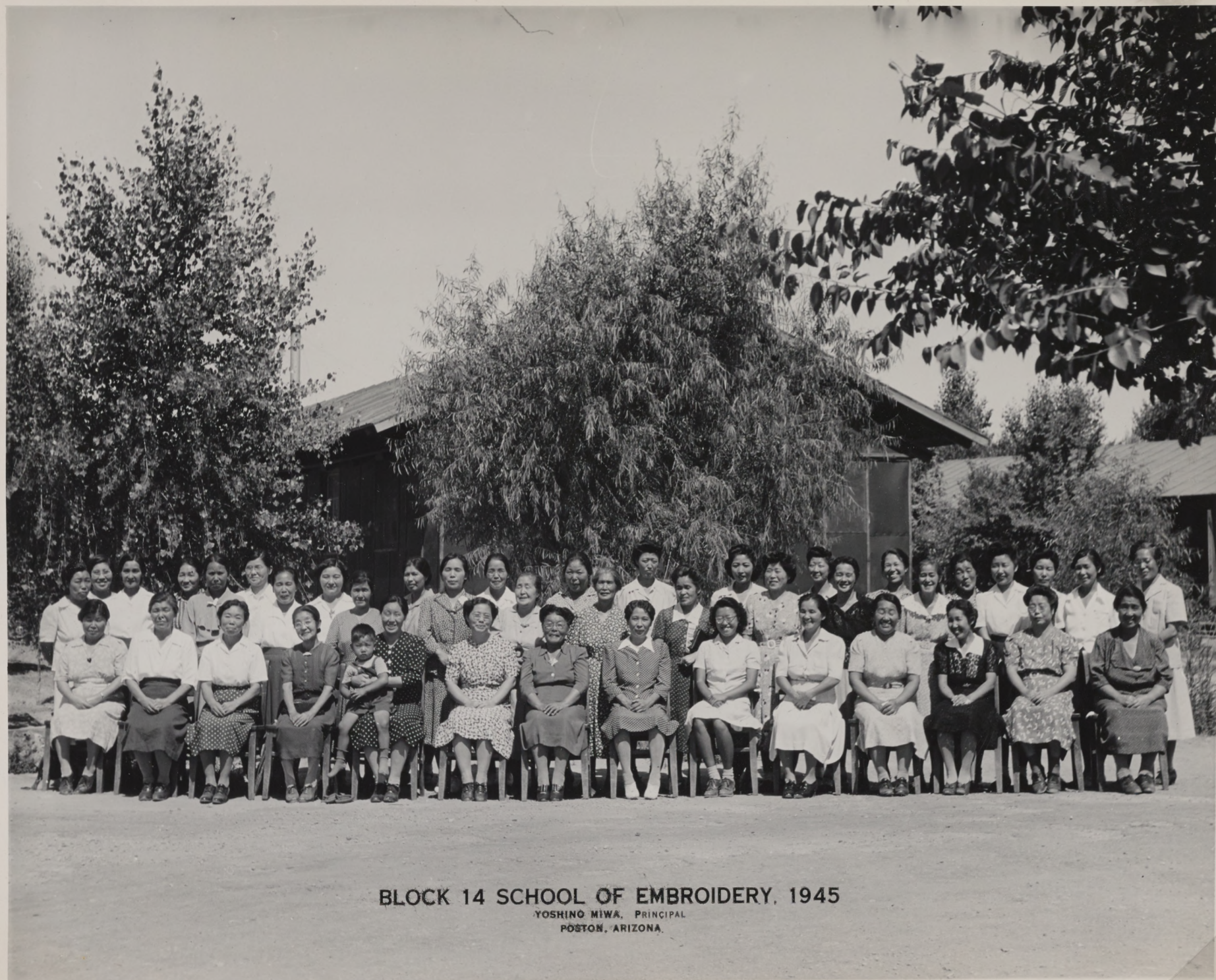
BLOCK 14 SCHOOL OF EMBROIDERY, 1945