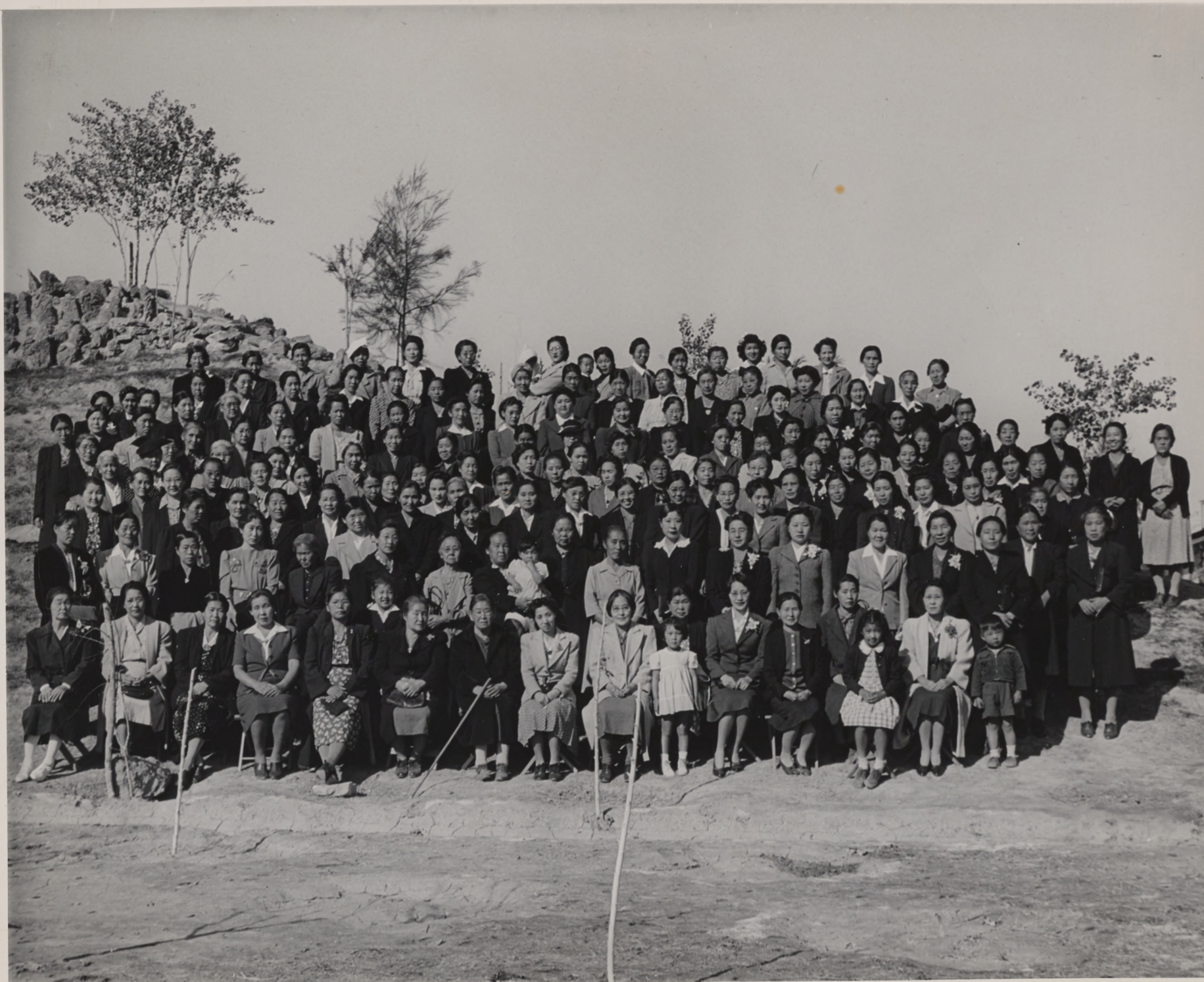
ARTIFICIAL FLOWER MAKING CLASS