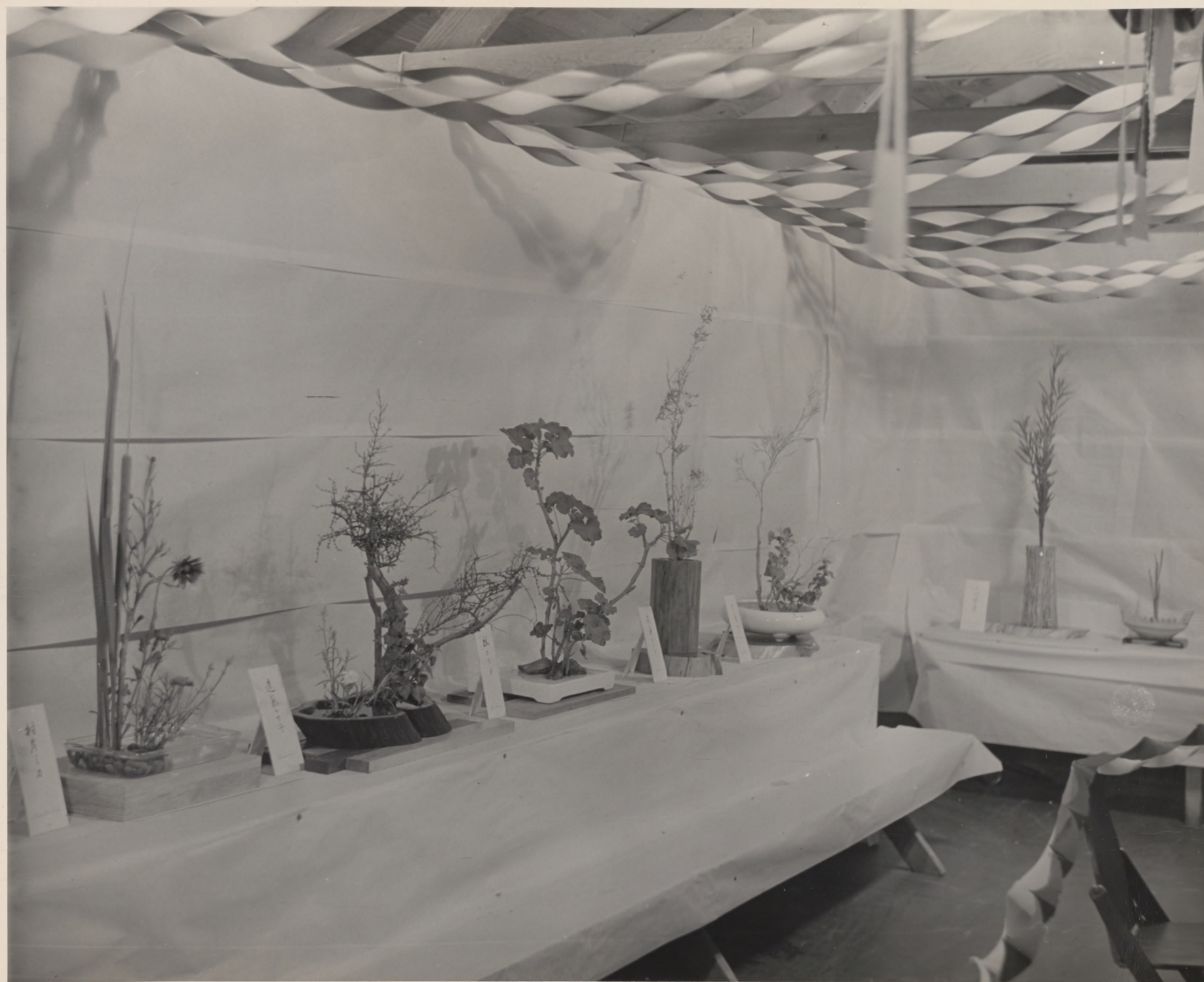
FLOWER ARRANGEMENT EXHIBIT