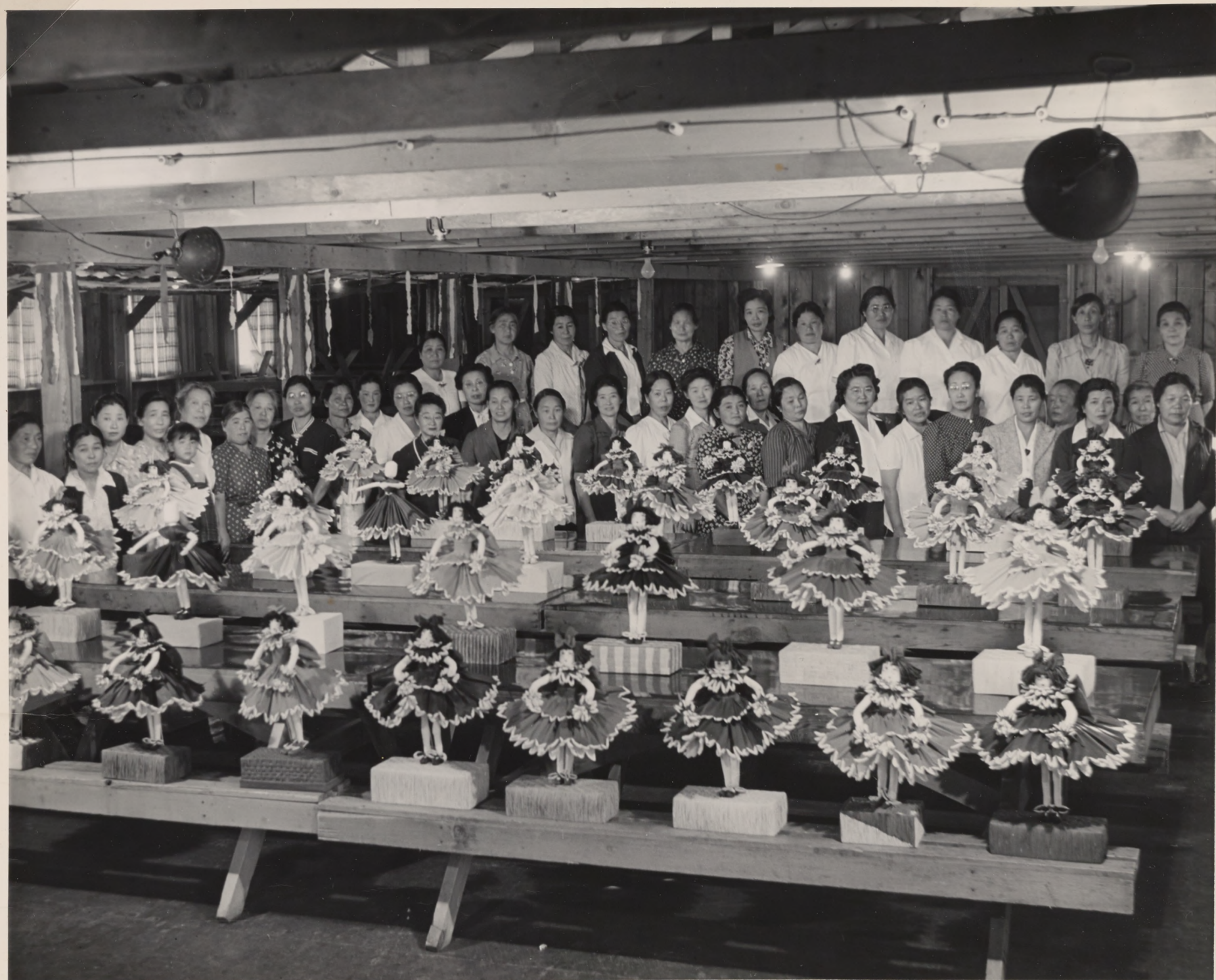
ARTIFICIAL FLOWER AND DOLL MAKING CLASS