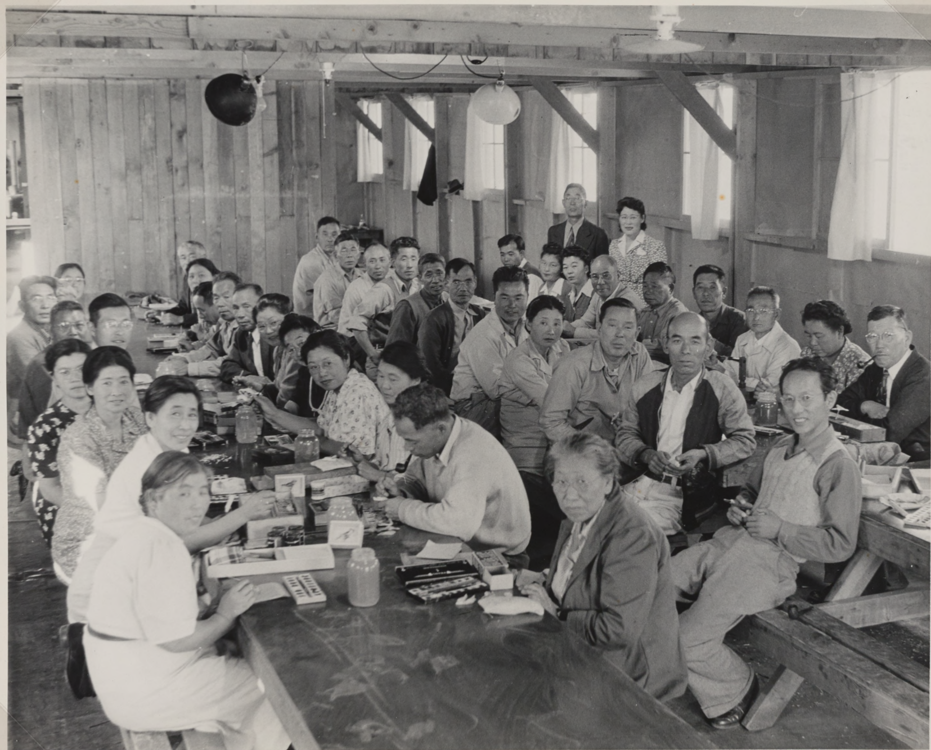
BIRD MAKING CLASS