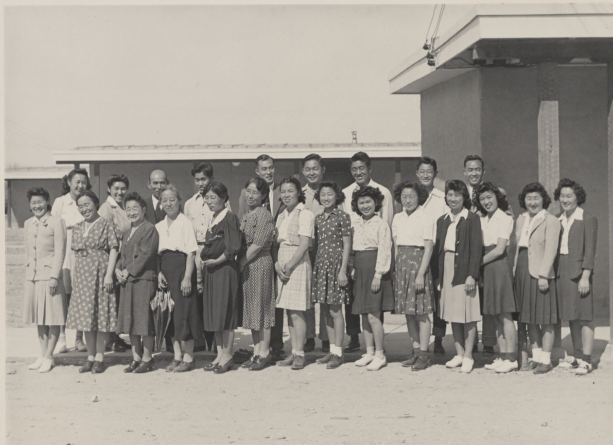
JAPANESE LANGUAGE CLASS