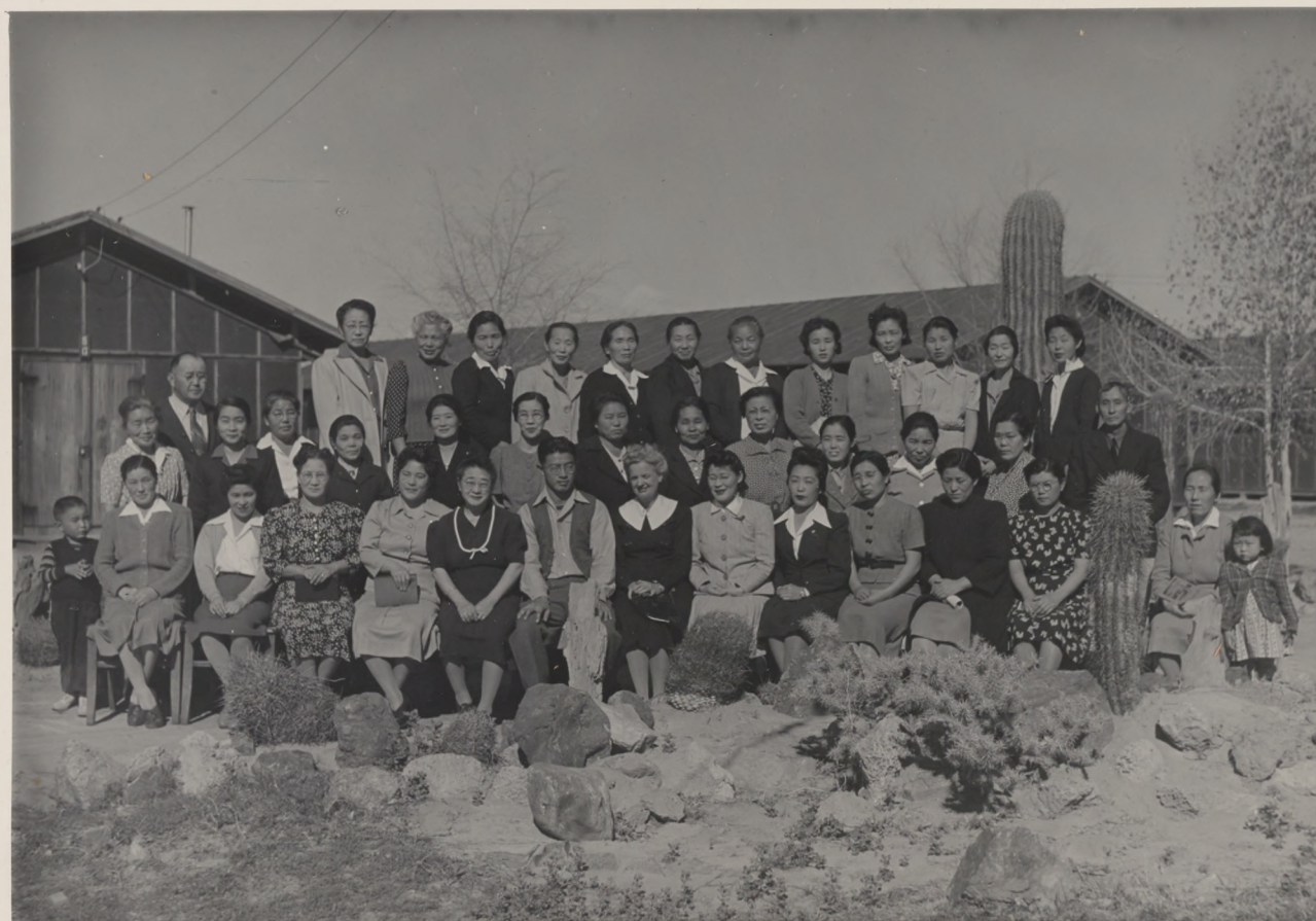
ENGLISH AND AMERICANIZATION CLASS