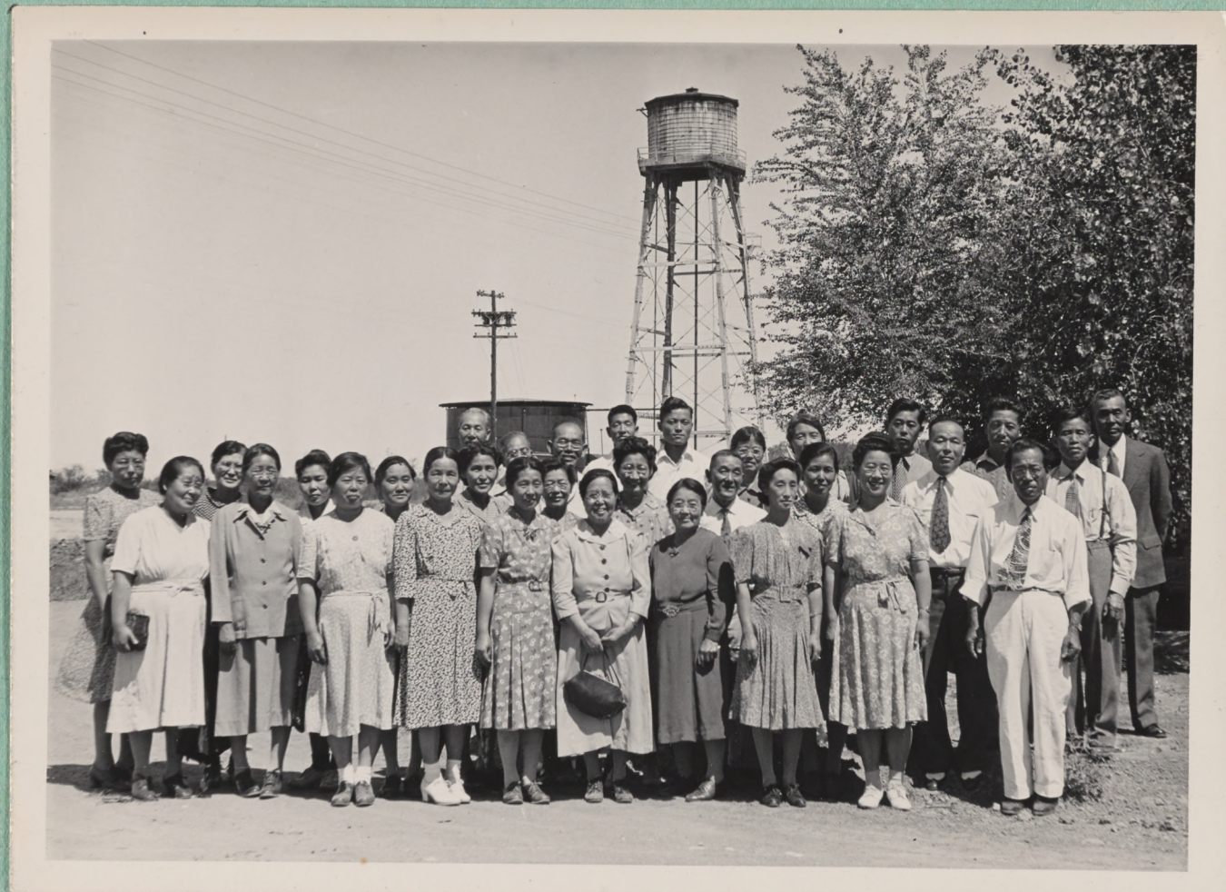
BIRD CARVING CLASS