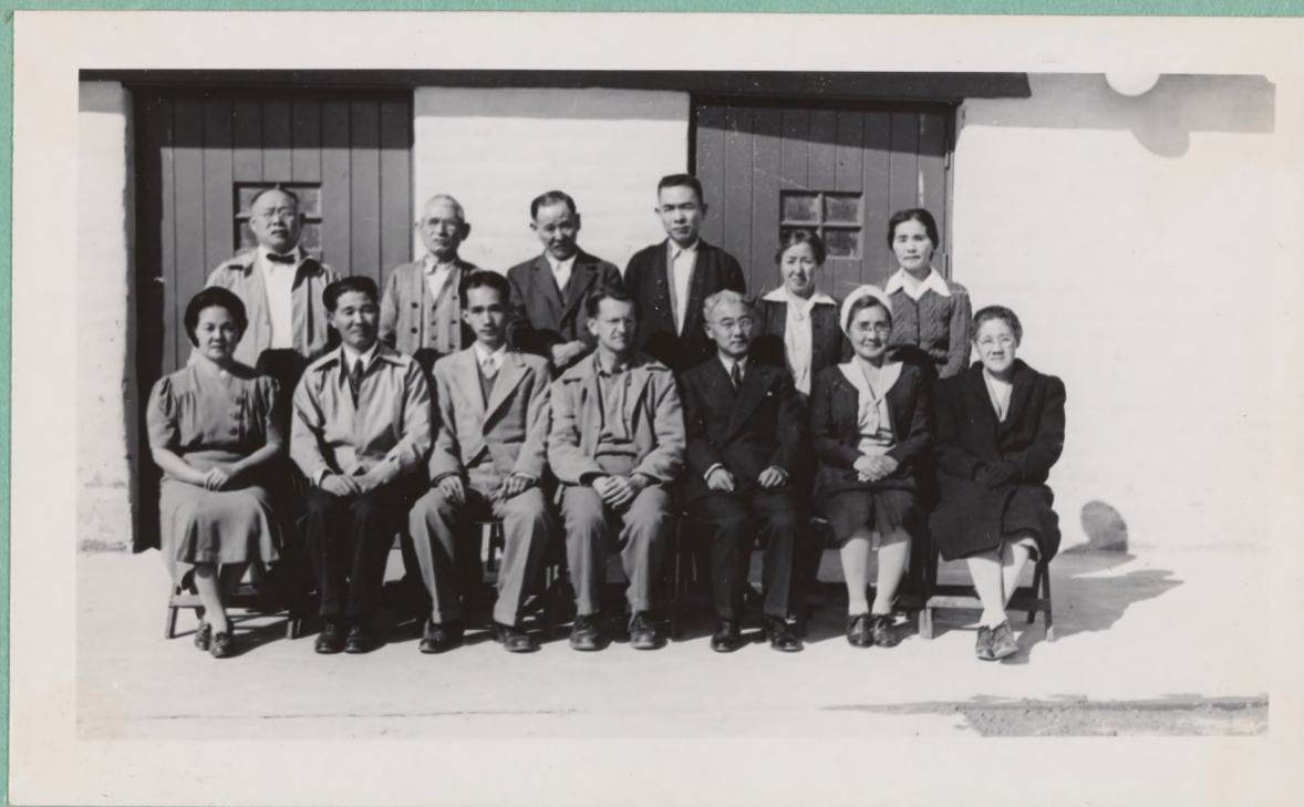
ENGLISH AND AMERICANIZATION CLASS