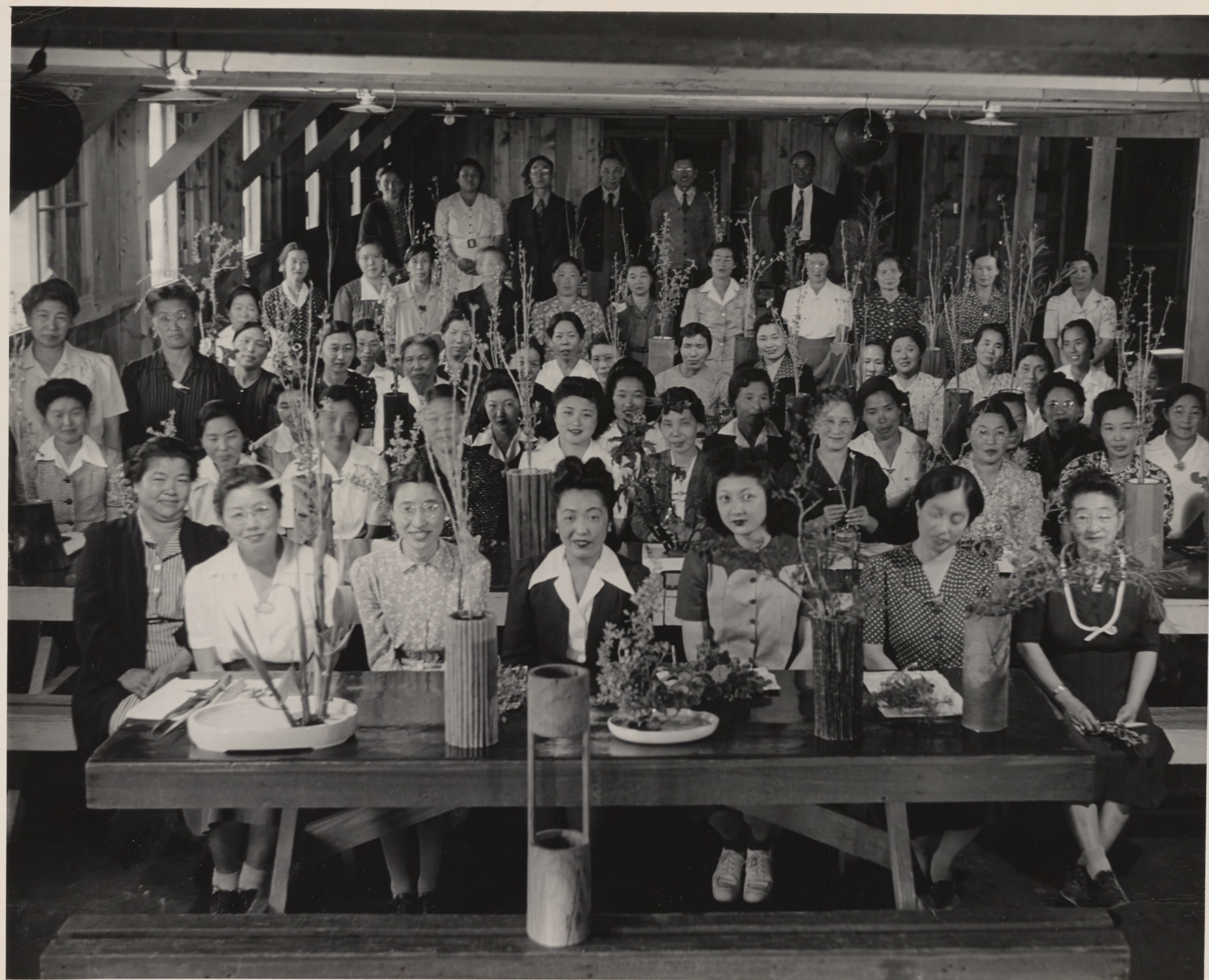
FLOWER ARRANGEMENT CLASS