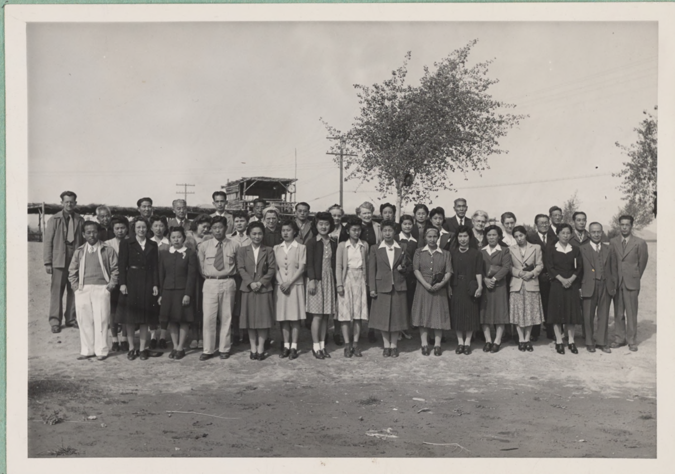
ADULT EDUCATION STAFF, CAMP I