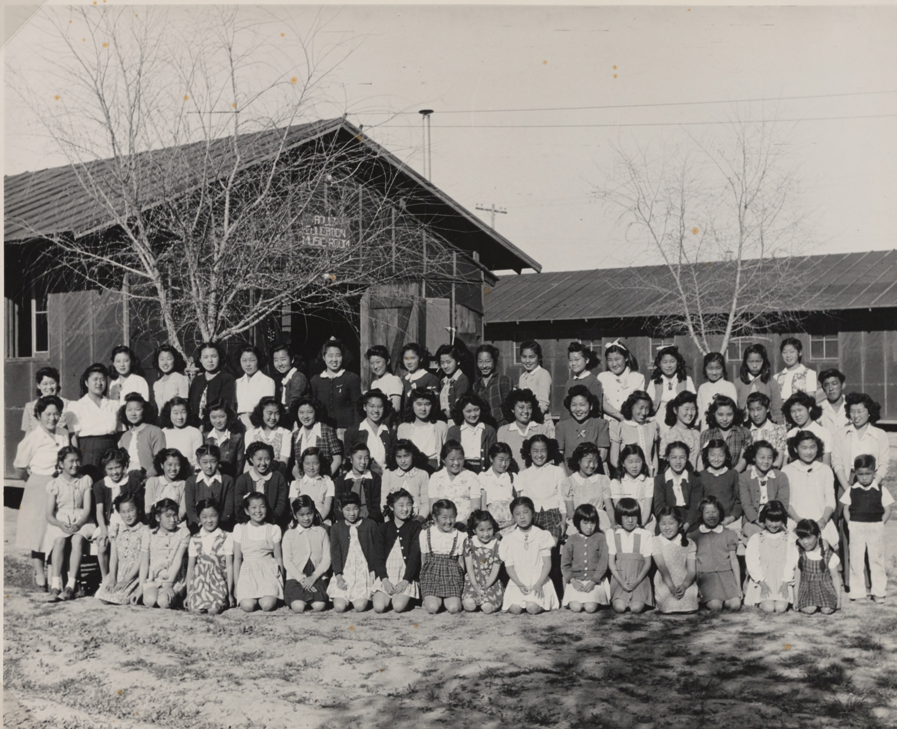
PIANO AND VIOLIN STUDENTS