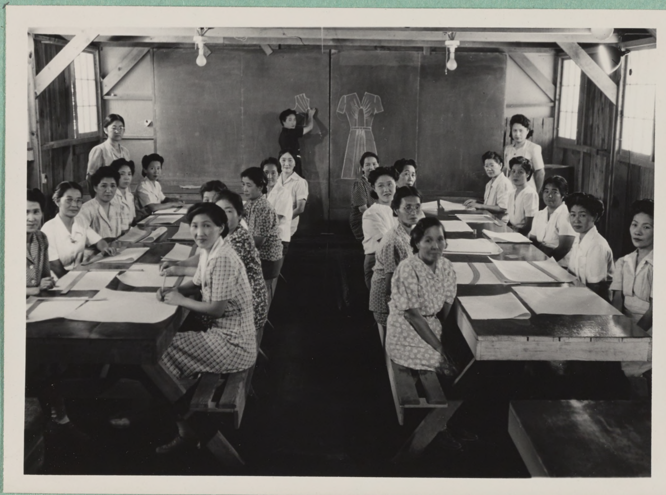
PATTERN DRAFTING CLASS