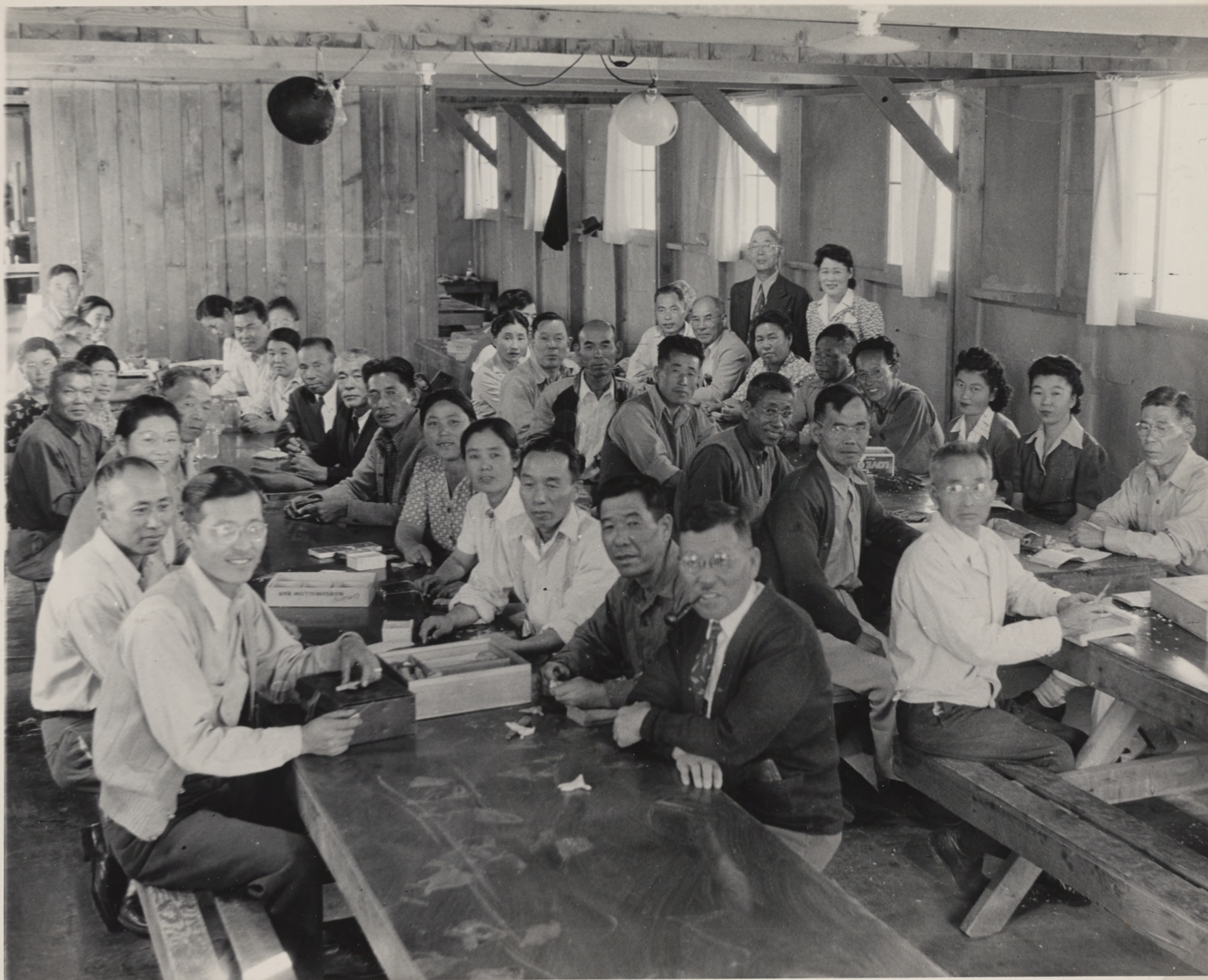
BIRD CARVING CLASS