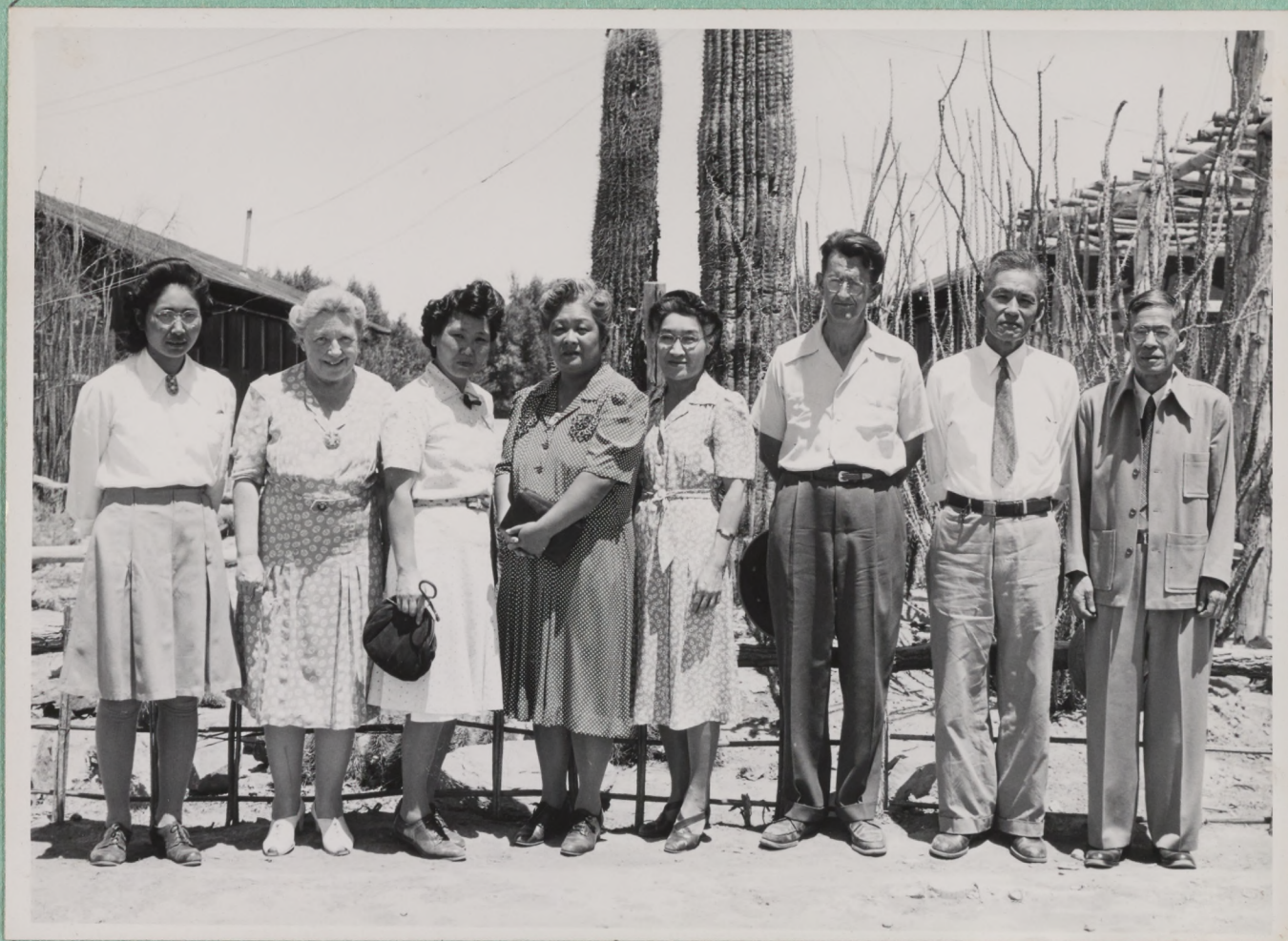
ADULT EDUCATION STAFF, CAMP III