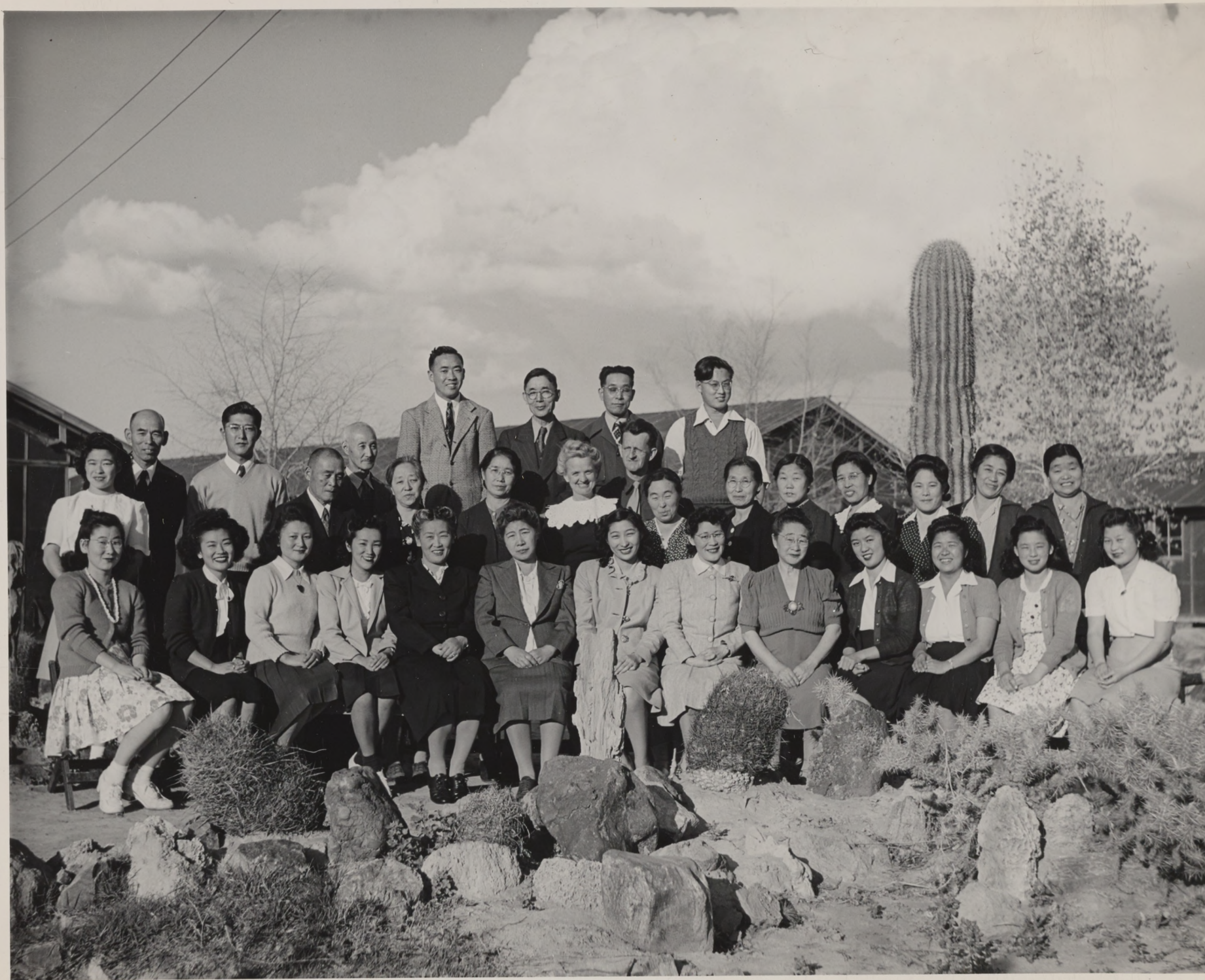
ADULT EDUCATION STAFF, CAMP II