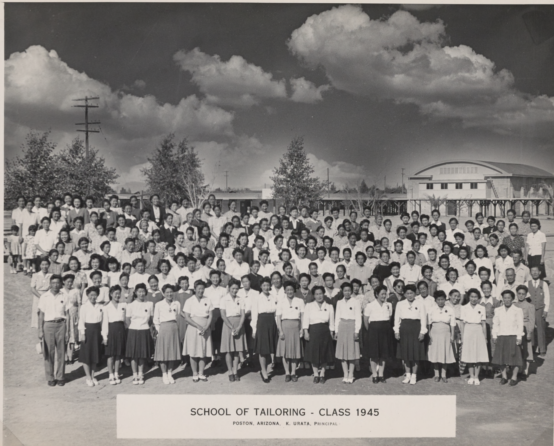
SCHOOL OF TAILORING - CLASS 1945