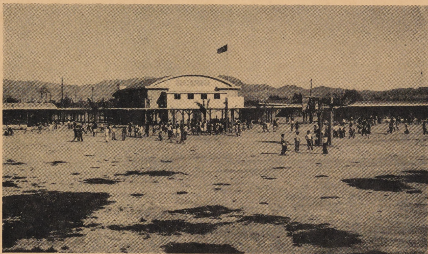
AUDITORIUM AND CHILDREN AT PLAY