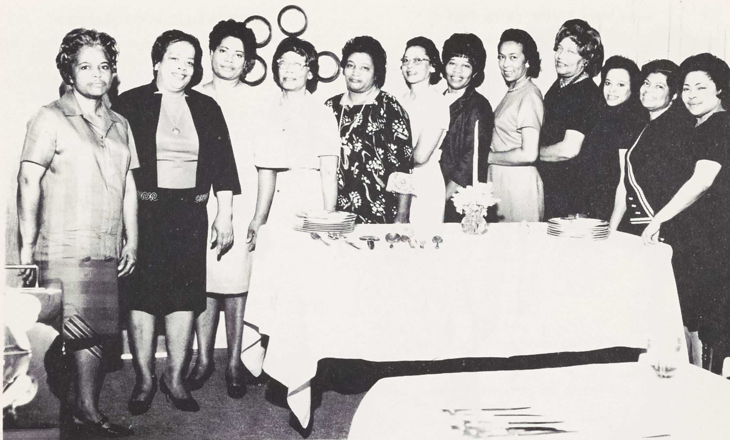
AGNES KNIGHT SOCIAL AND STUDY CLUB