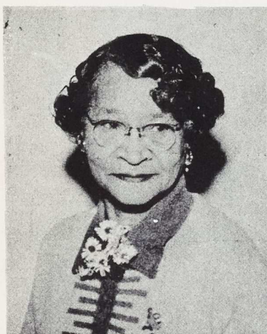
Past State President National Chaplain (Deceased)